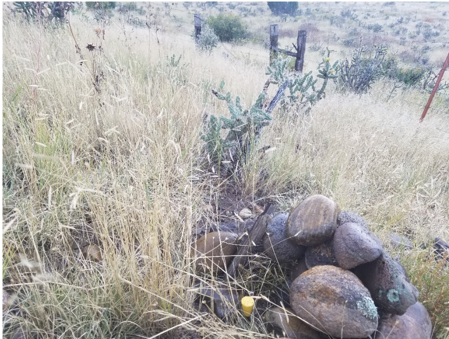
Figure 1. The southwest survey marker.