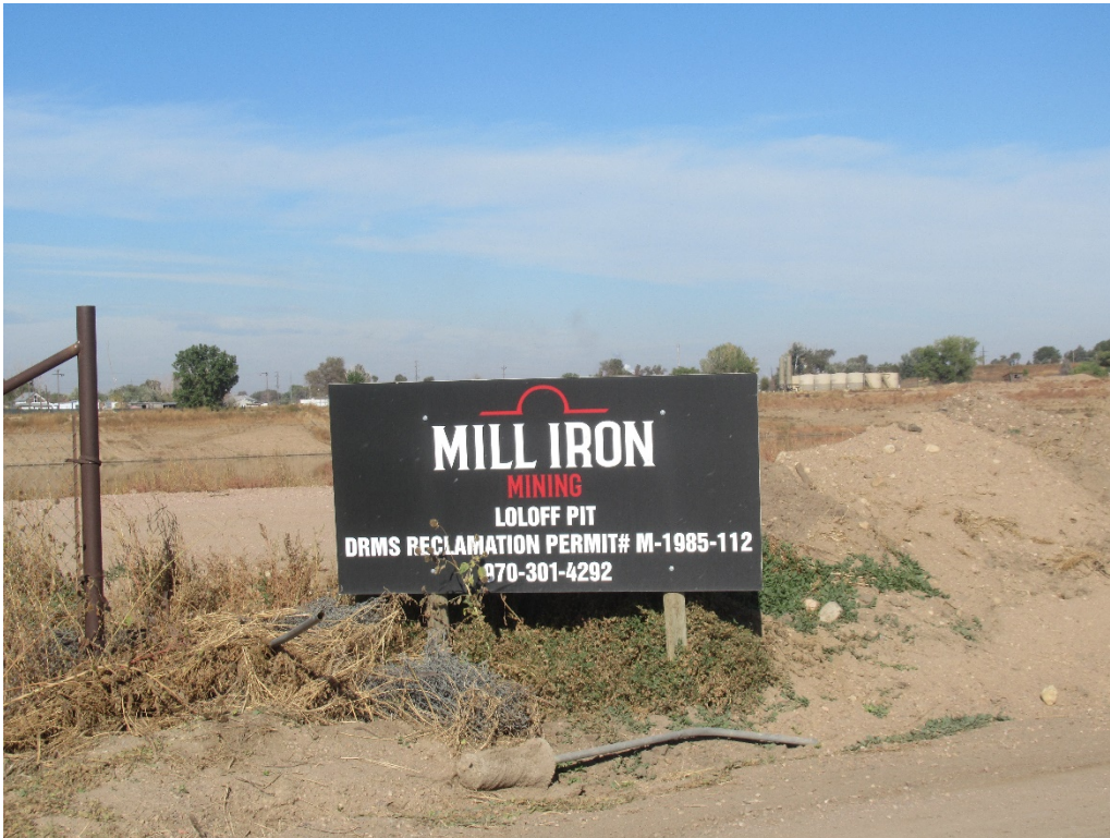
View of the Loloff Mine mine sign