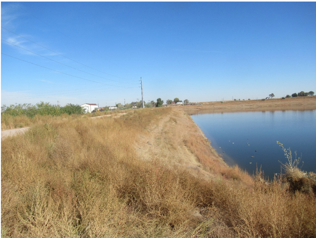
View of the west shoreline from the southwest corner of the reservoir looking north