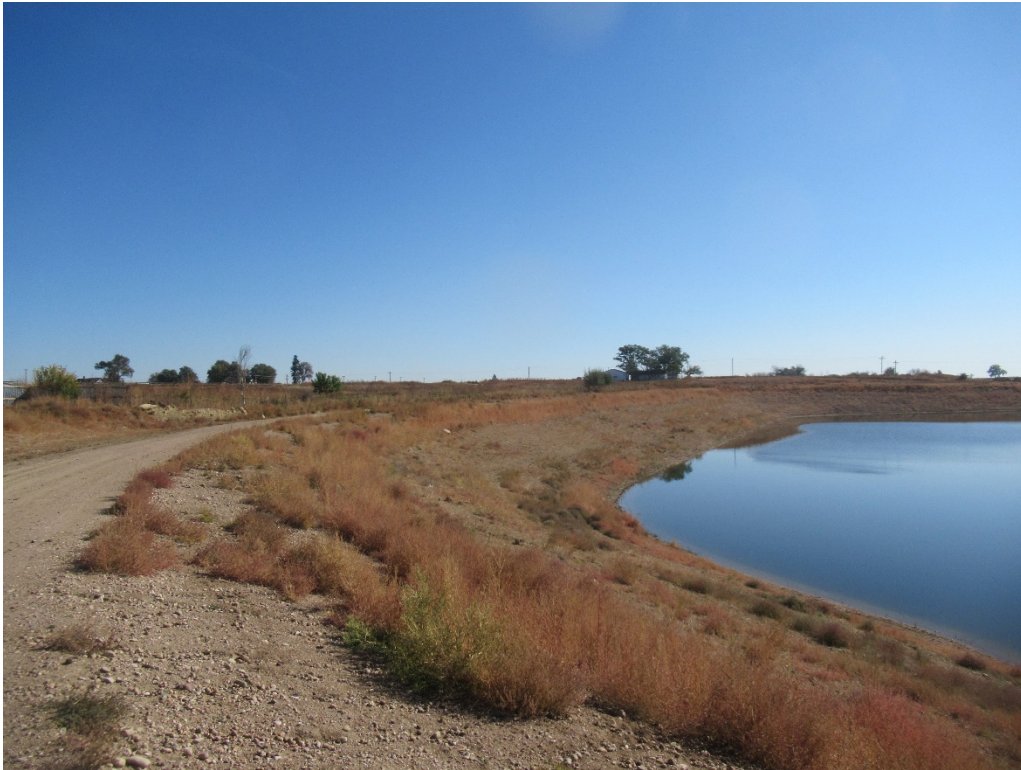
View of the north shoreline from the northwest corner of the reservoir looking east