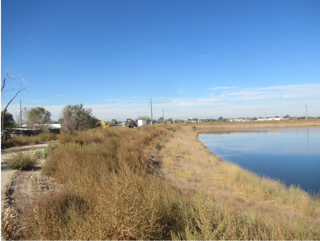
View of the south shoreline from the southeast corner of the reservoir looking west