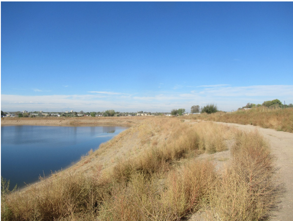
View of the north shoreline from the northeast corner of the reservoir looking west