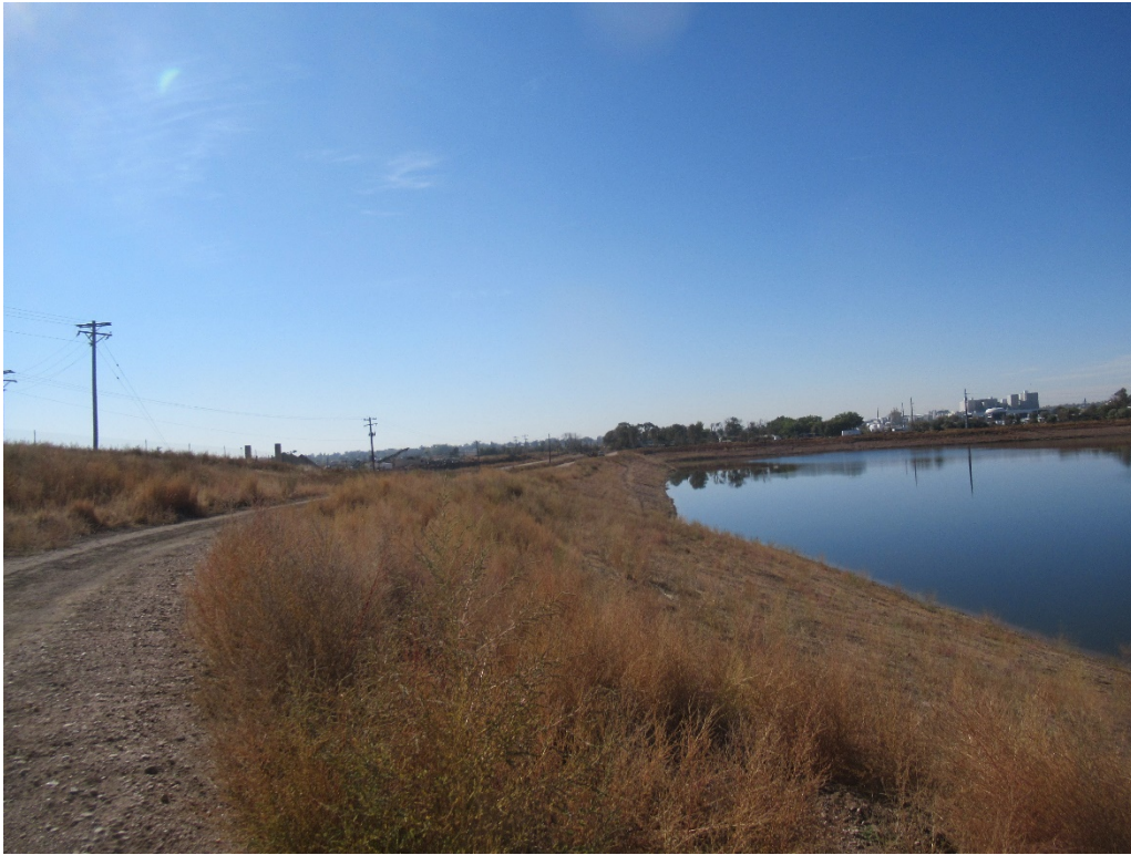
View of the east shoreline from the northeast corner of the reservoir looking south