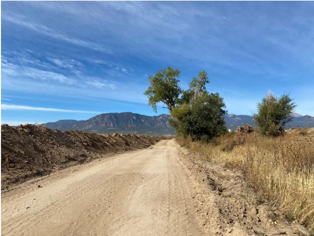
Photo 5. Stockpiled sand for final lift, access road and ditch (looking west)