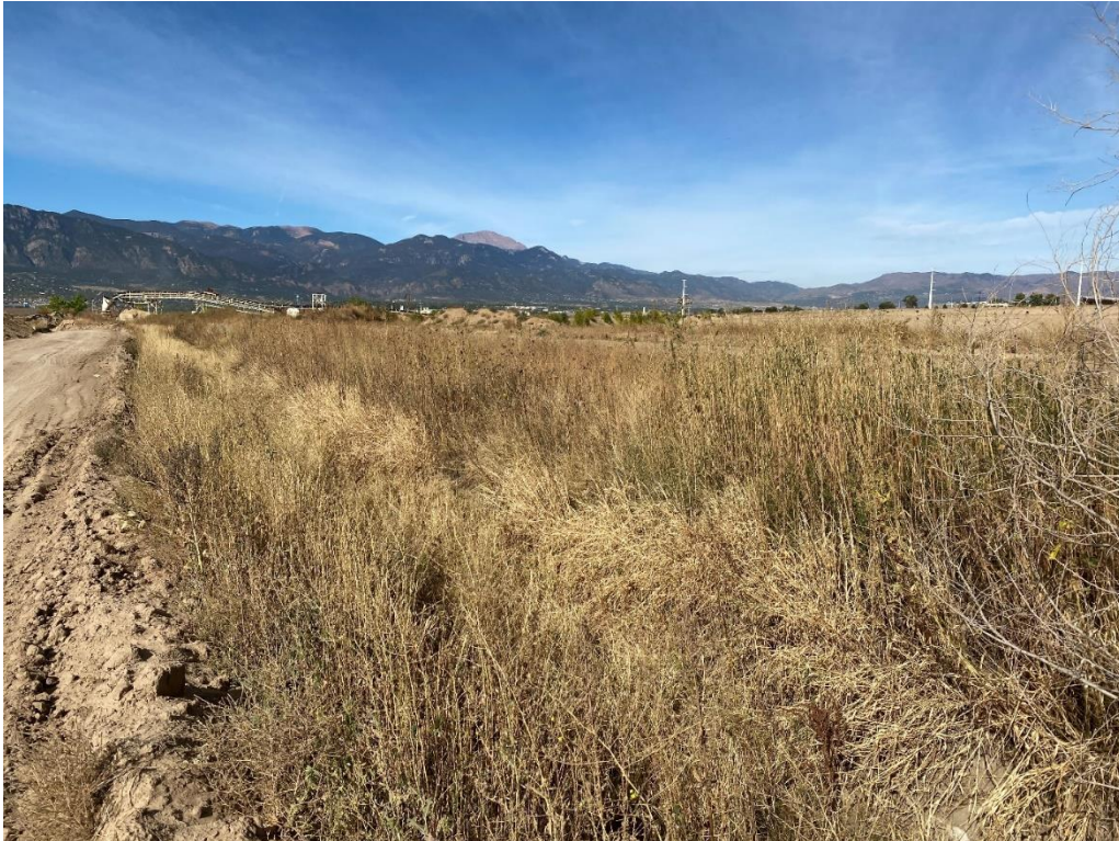
Photo 1. Fountain Mutual Ditch looking west