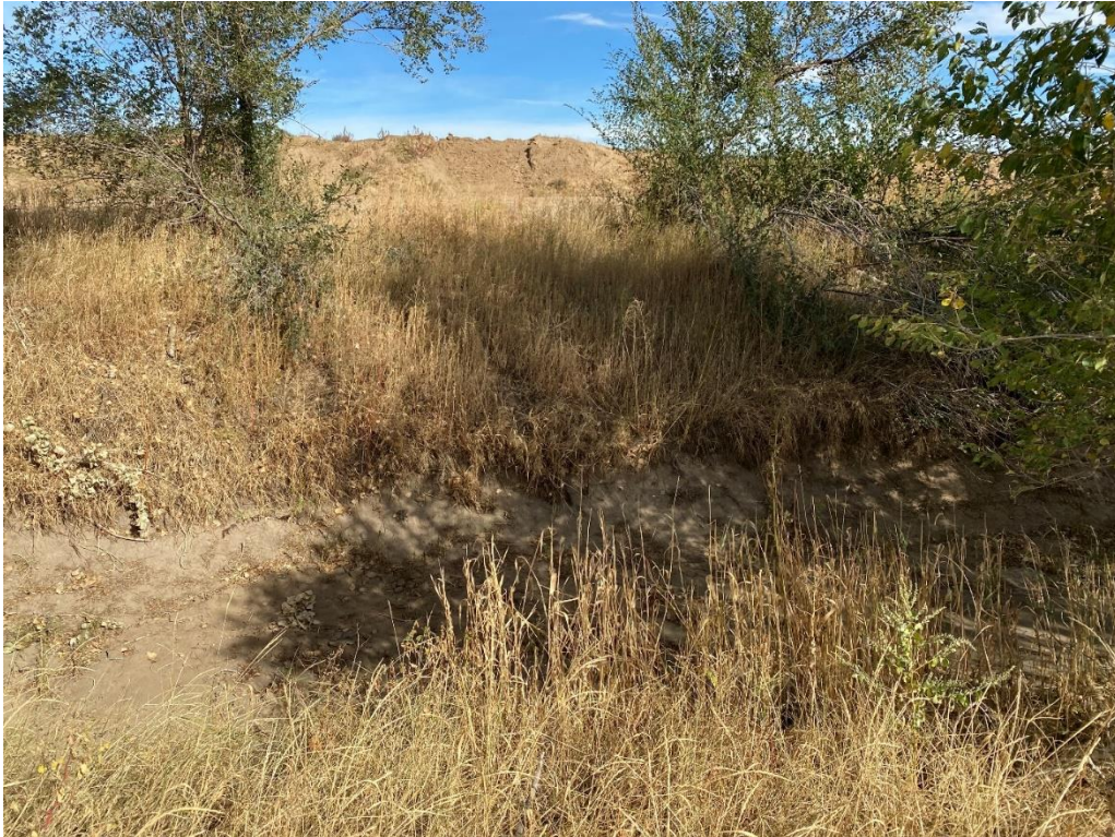
Photo 3. Fountain Mutual Ditch looking north