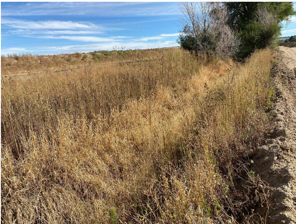
Photo 2. Fountain Mutual Ditch looking east