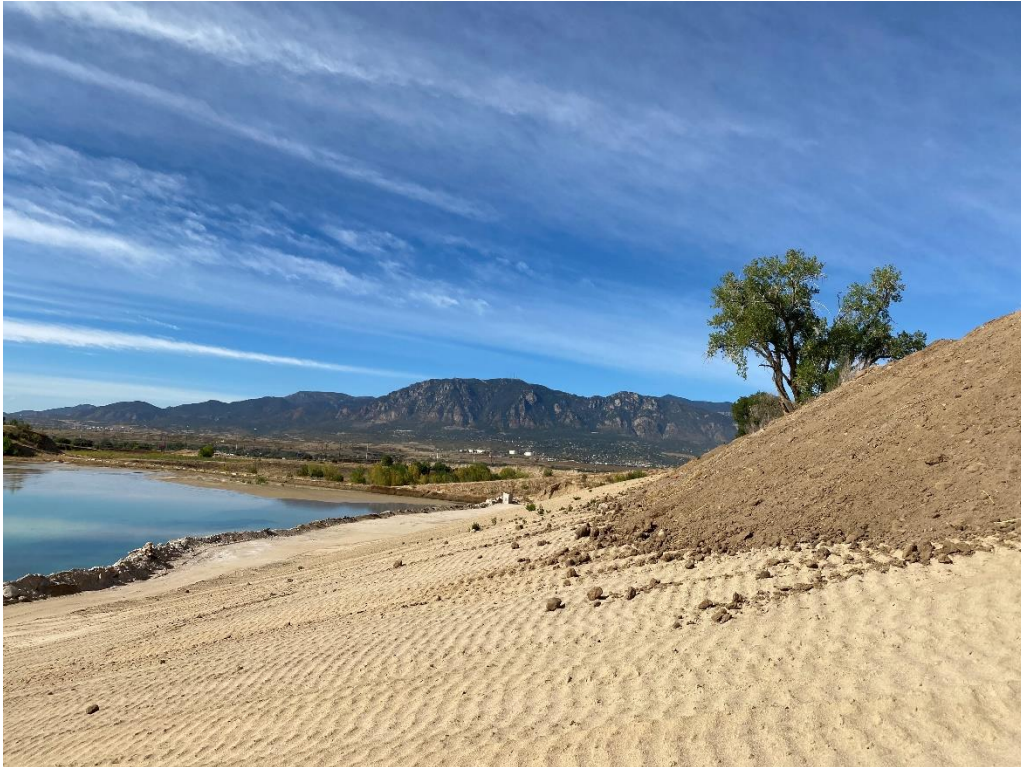
Photo 6. Stockpiled sand for final lift

If you have any questions regarding the contents of this report, please contact Aggregate Industries or Lithos Engineering.