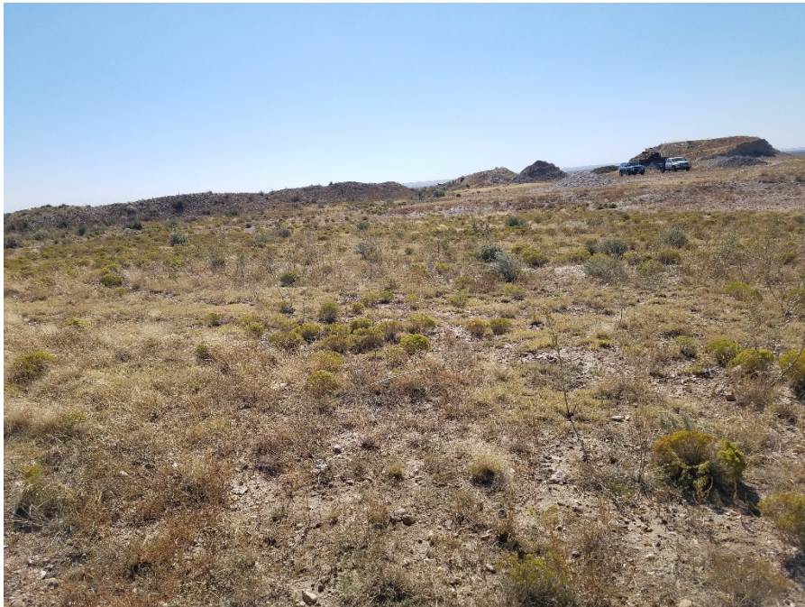
Figure 2. From the north end of the Phase 1 area looking south.