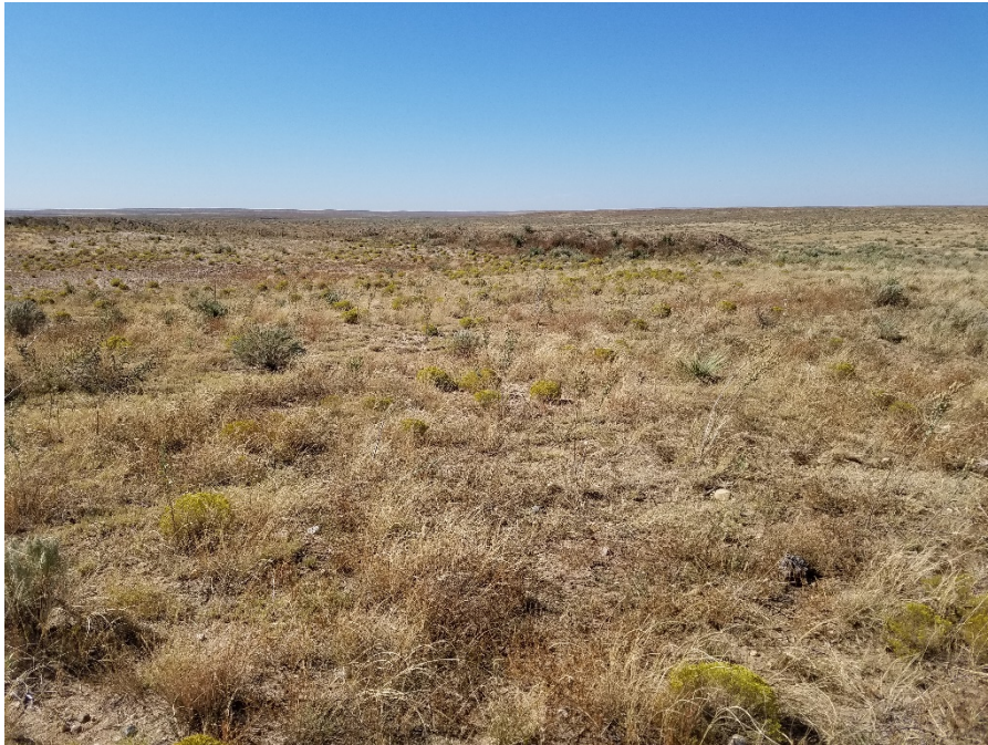
Figure 1. From the northeast corner of the Phase 1 affected land looking west.