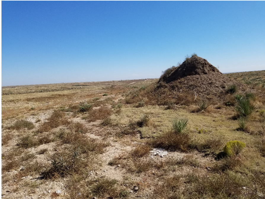
Figure 3. From the southwest corner of the Phase 2 affected land looking east.