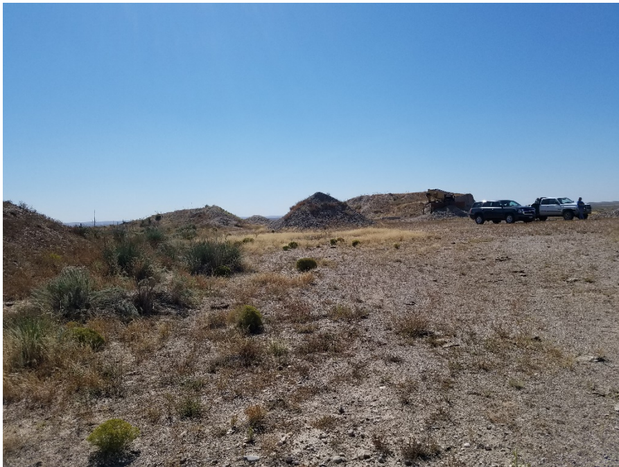
Figure 6. From the center of the Phase 1 area looking south.