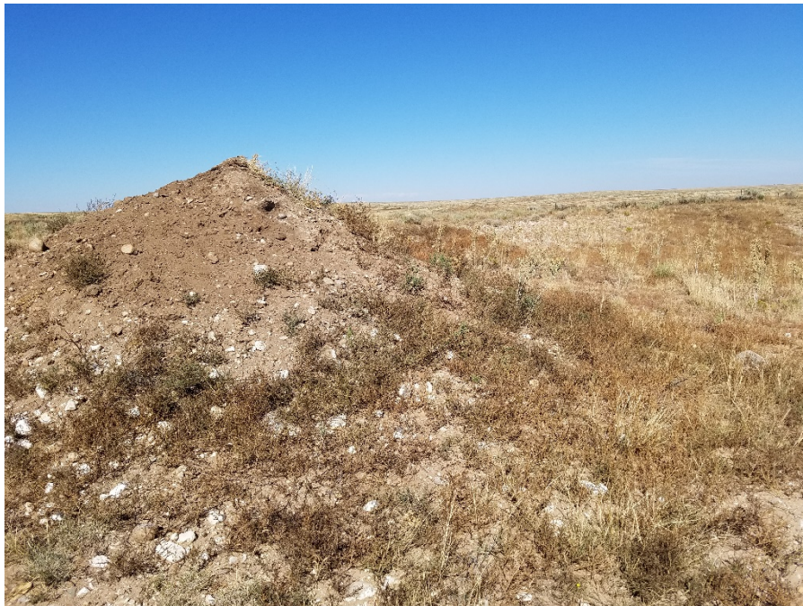
Figure 4. From the southeast corner of the affected land looking north.