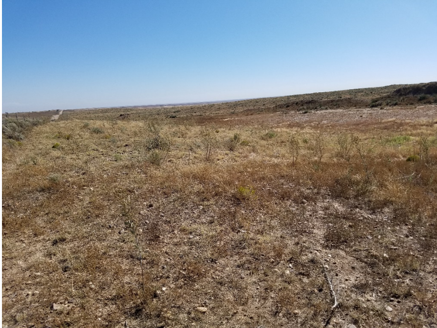
Figure 5. From the northwest corner of the Phase 2 area looking southeast.