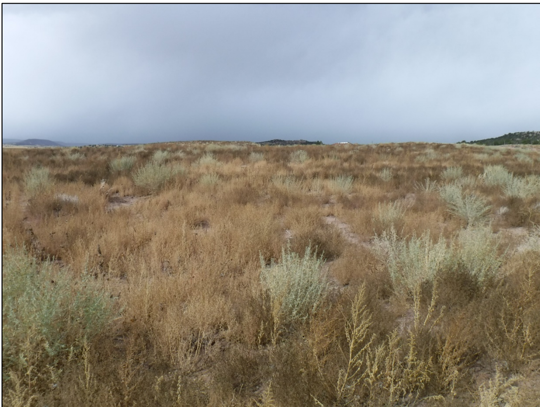
Photo 2: Kochia growing in disturbed areas of the site, east of reservoir