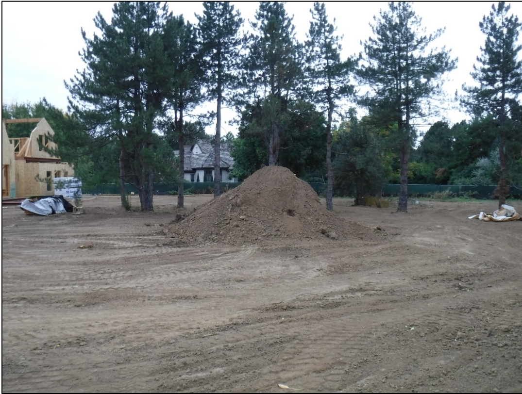
Photo 1: The remaining stockpile of material at the South Lafayette location