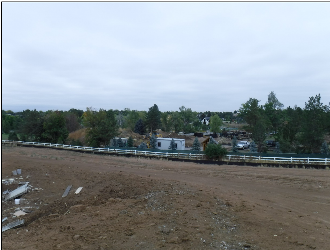
Photo 5: Looking north from the 4645 S. Holly St to the 4545 S. Holly St location