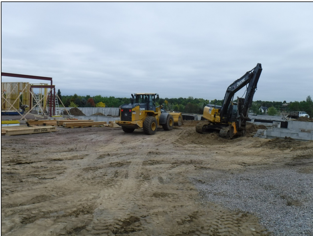
Photo 4: Backfilling the same location where the Lafayette St material was used