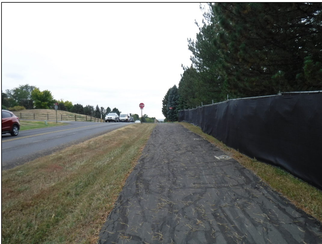
Photo 6: An example of the paved multi-use path, this one is along South Holly Street and the one along Quincy Street is further away from the road.