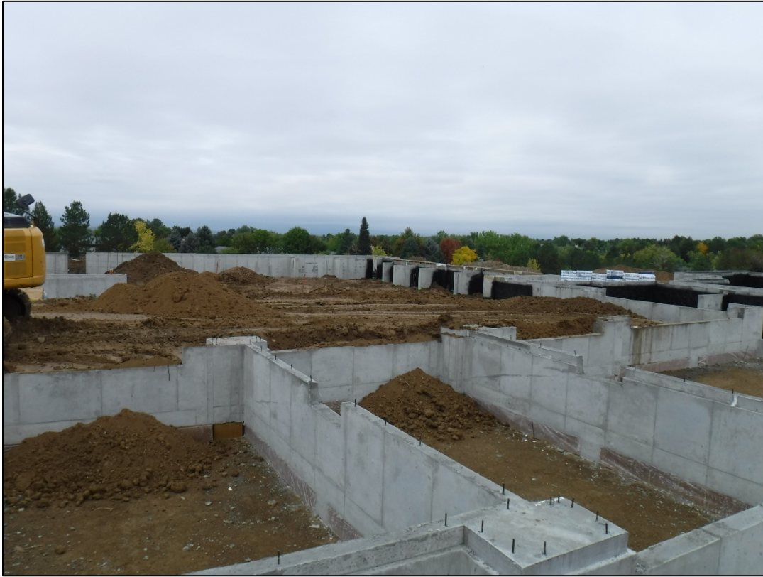
Photo 3: Backfilling newly formed foundations at 4645 South Holly St