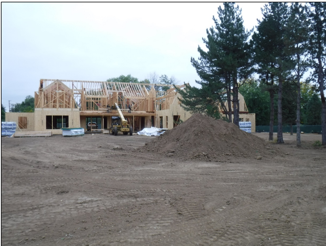
Photo 2: New single-family dwelling at the South Lafayette location