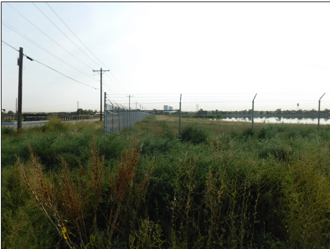
Photo 4: Looking east from the corner of Tucson and 168 th Streets