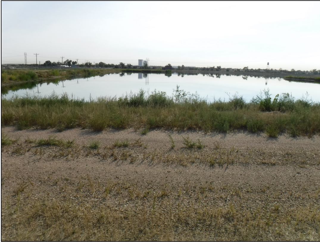
Photo 3: Maintenance road that would have been the base for the belt