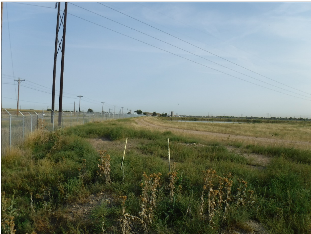
Photo 2: Looking north along the axis of conveyor corridor, the belt would have been within the fenced area