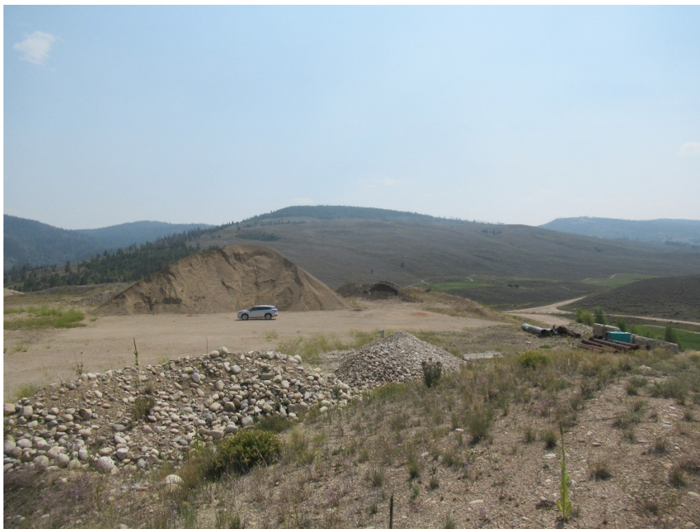
View of the pit floor looking south