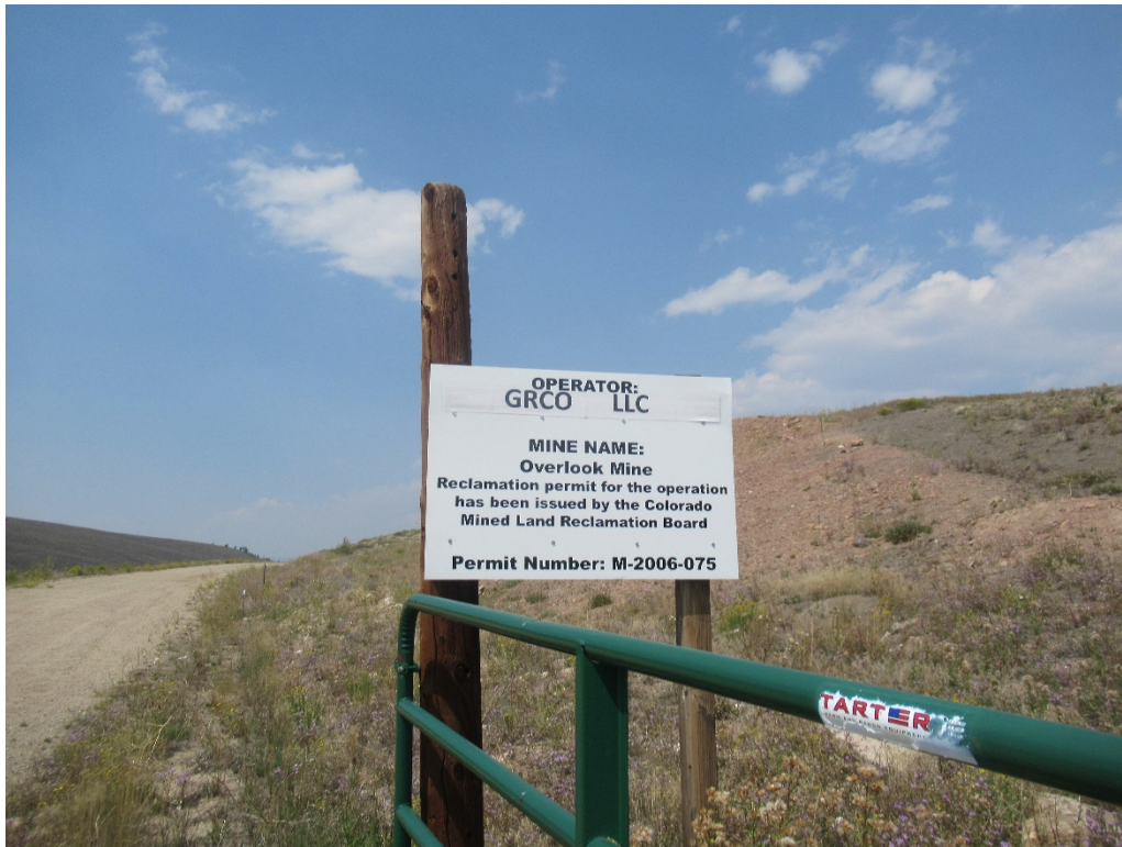
Overlook Mine mine sign