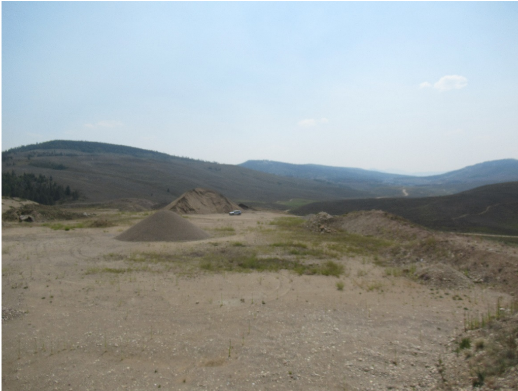
View of the site from the north highwall looking southwest