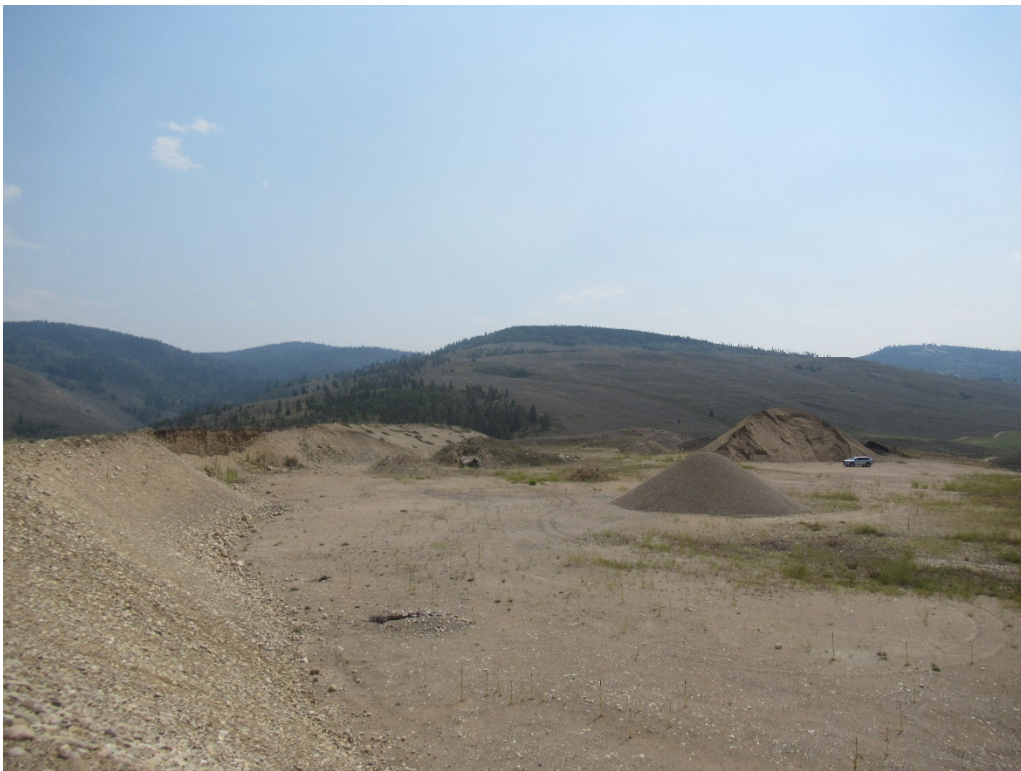
View of the site from the north highwall looking southeast