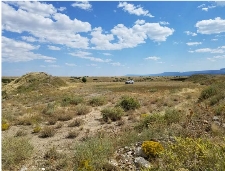
Figure 3. From the northwest corner of the site looking southeast