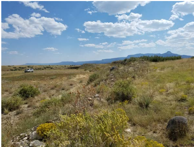
Figure 2. From the northwest corner of the site looking south.