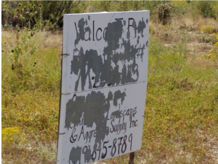
Figure 1. Unreadable mine entrance sign.