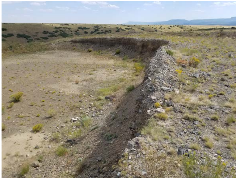
Figure 4. From the southwest corner of the highwall looking southeast.