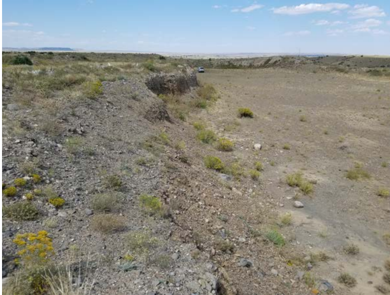
Figure 5. From the southwest corner of the highwall looking north.