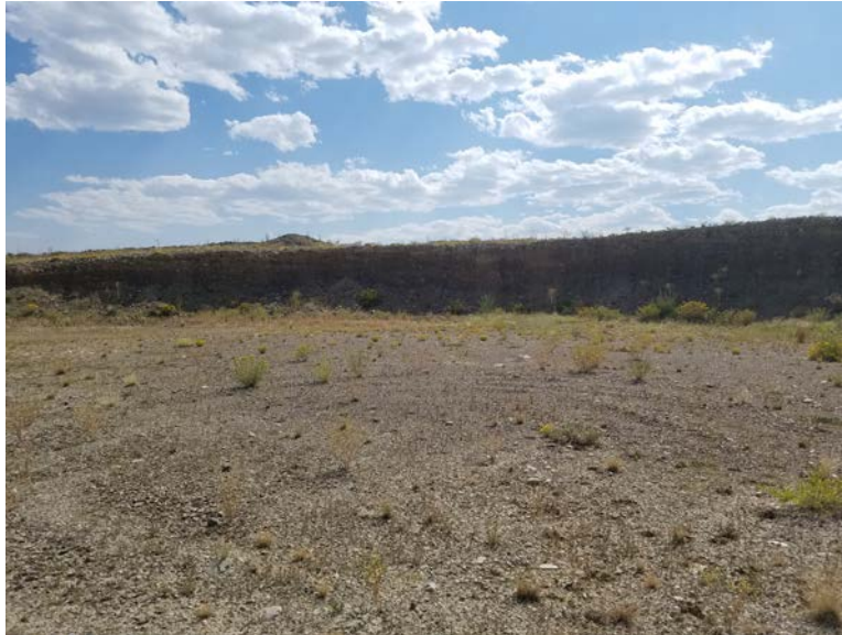
Figure 6. From the pit floor looking south at the highwall.