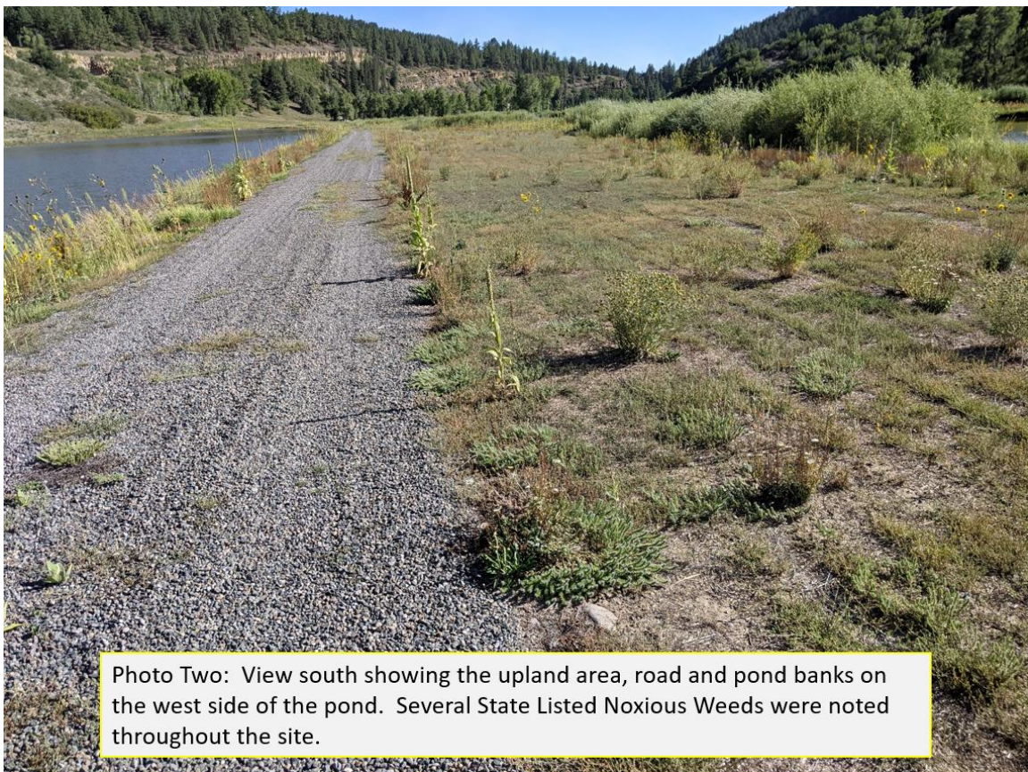
Photo Two: View south showing the upland area, road and pond banks on the west side of the pond. Several State Listed Noxious Weeds were noted throughout the site.