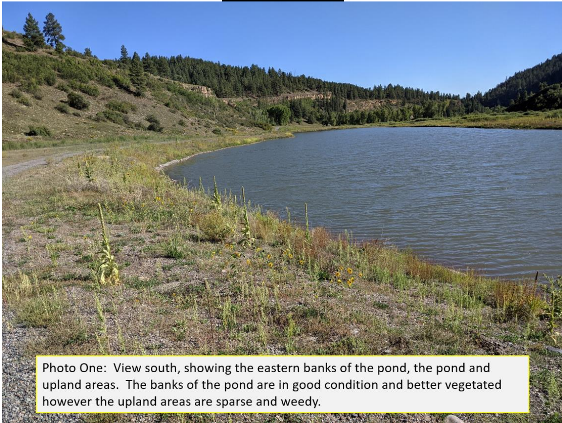
Photo One: View south, showing the eastern banks of the pond, the pond and upland areas. The banks of the pond are in good condition and better vegetated however the upland areas are sparse and weedy.