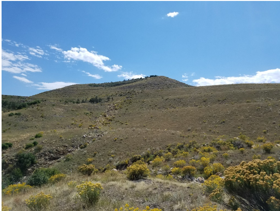
Figure 1. Fill 8