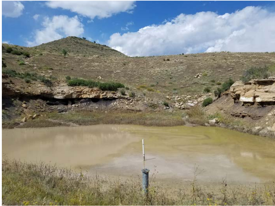
Figure 3. Pond 009a, and Fill 9

Number of Partial Inspection this Fiscal Year: 1