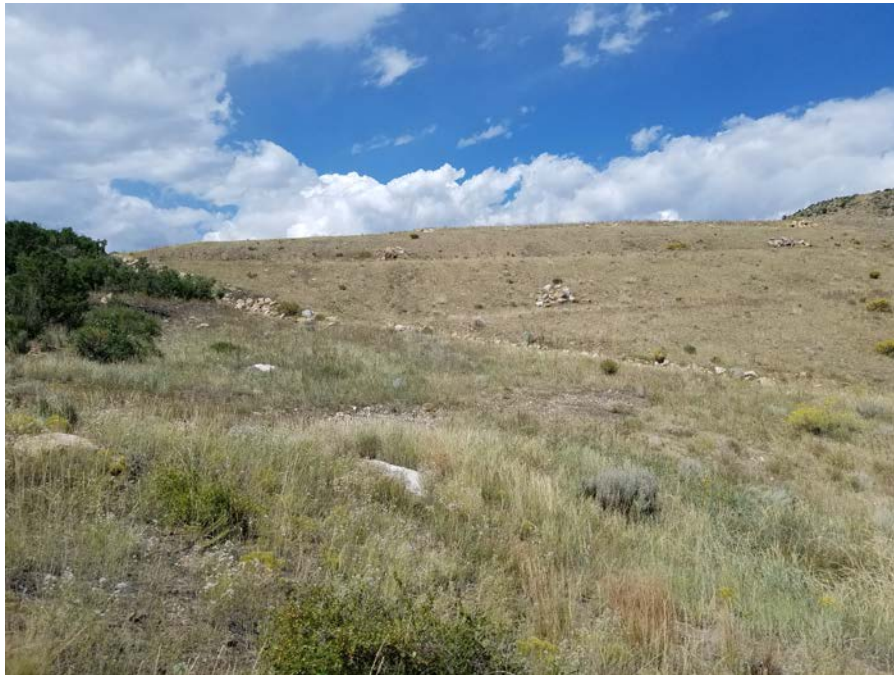
Figure 2. Fill 7

Number of Partial Inspection this Fiscal Year: 1