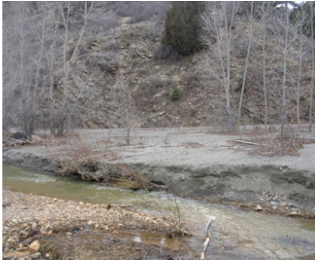
(C.) Murky water in North Clear Creek, full of particulates from Gilpin Waste Fines Dump site