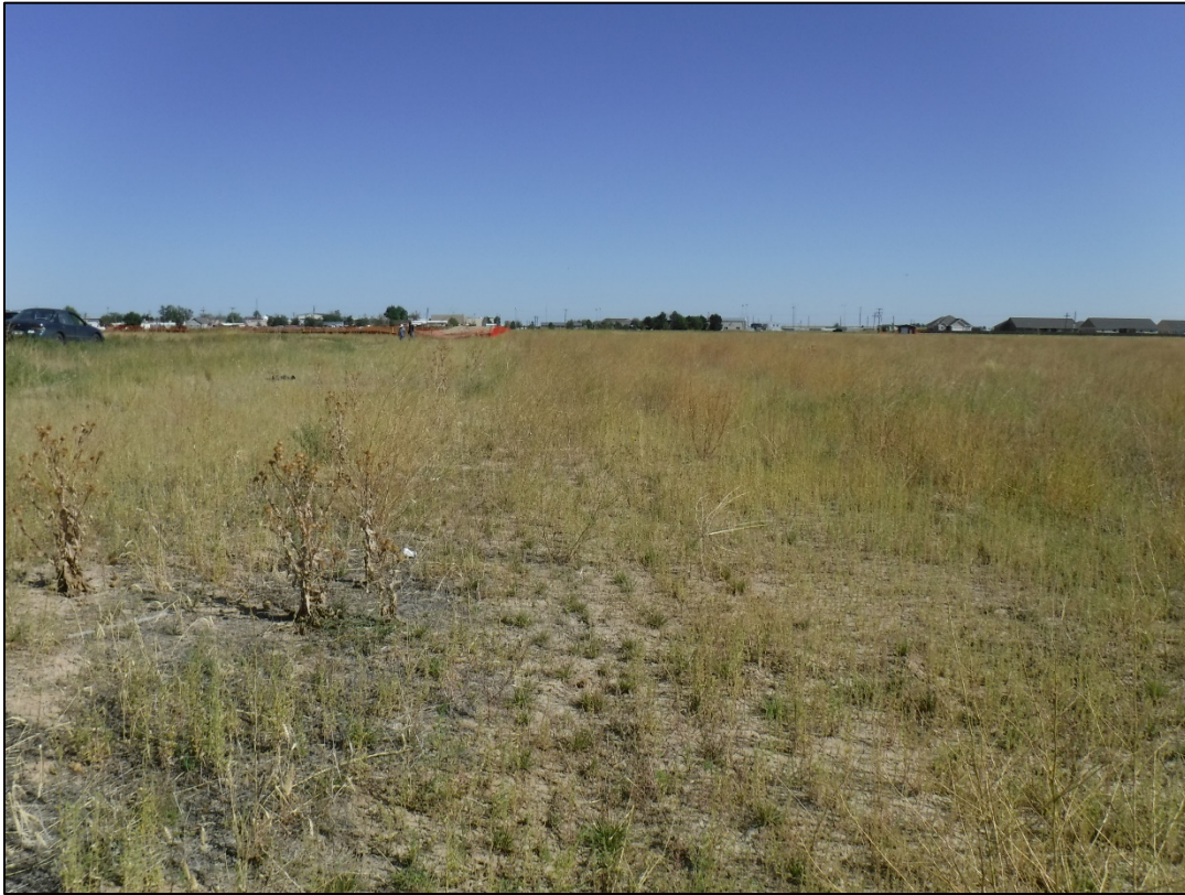
Photo 1: Growth in the south end of permit area looking north, orange fence is the edge of construction activities encroaching unaffected land of permit boundary