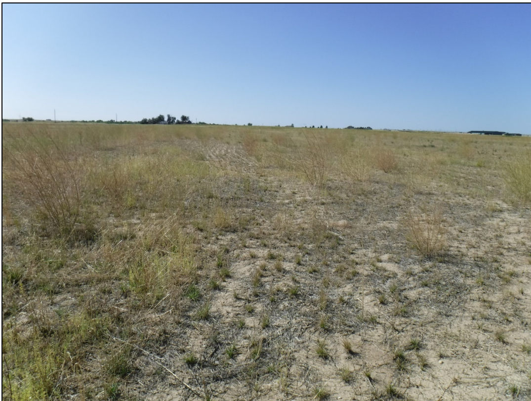
Photo 6: Looking south near the border where the vegetation begins to thin