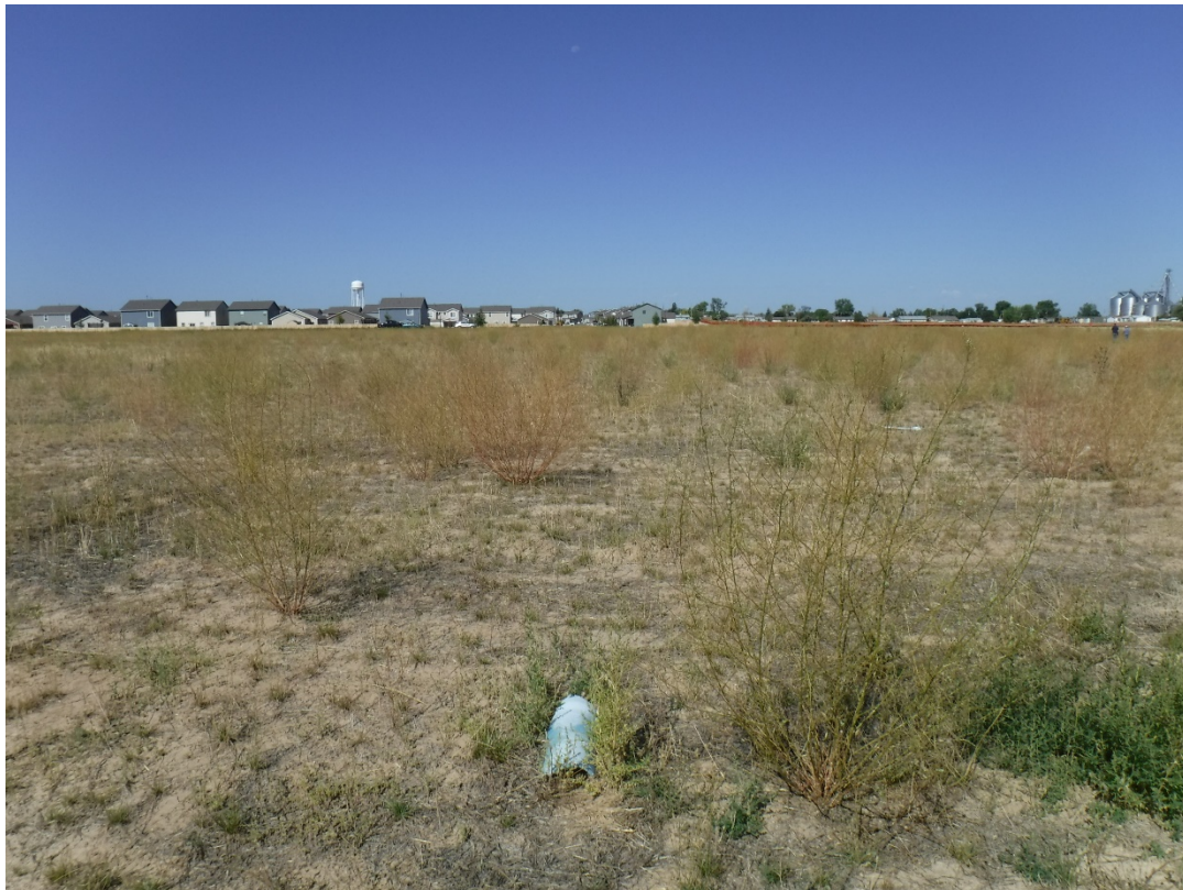
Photo 4: Growth in the area where vegetation is not growing similar to other areas of permit, looking west