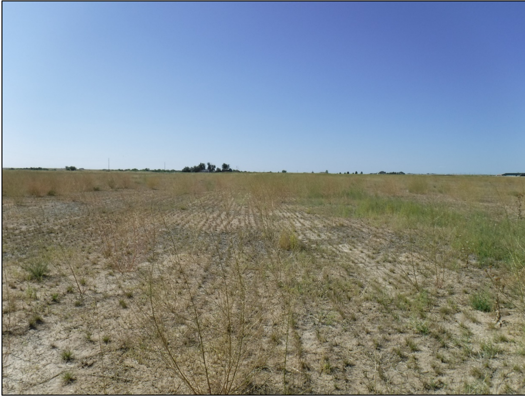
Photo 3: Growth in the area where vegetation is not growing similar to other areas of permit, looking south