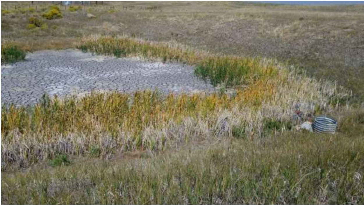
Truck loadout pond shown above.

Number of Partial Inspection this Fiscal Year: 2