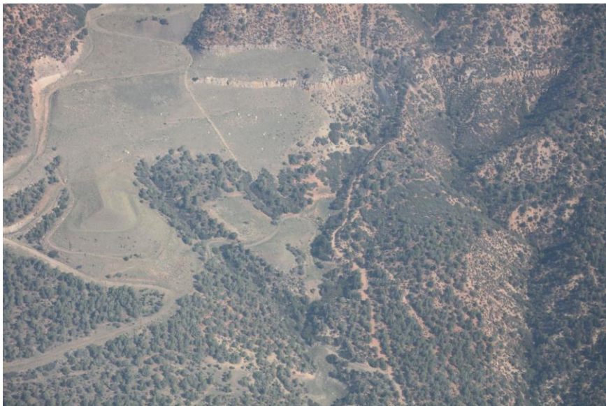
East Mine – lower area

Number of Partial Inspection this Fiscal Year: 2