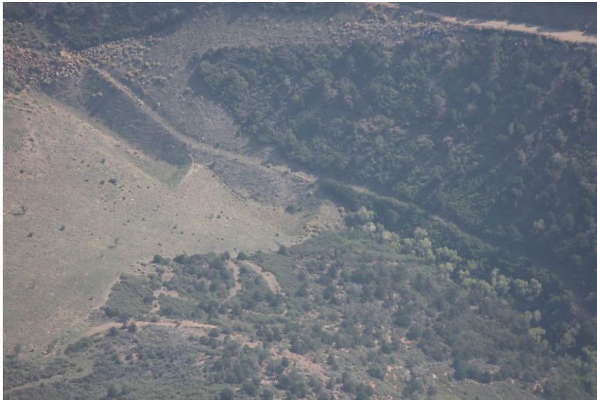
West Mine ponds

Number of Partial Inspection this Fiscal Year: 2