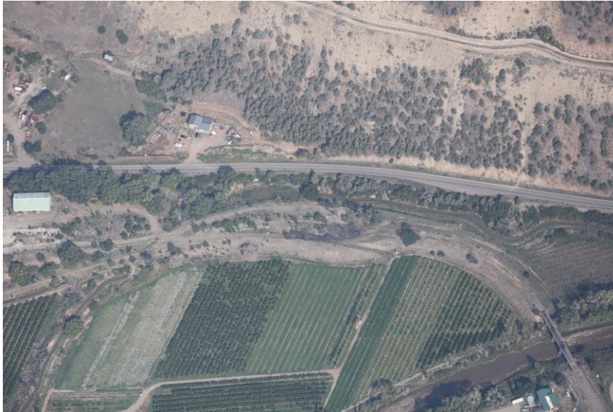
Loadout – pond and ends of 600' culvert