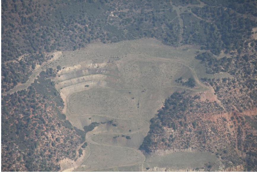
East Mine – upper area