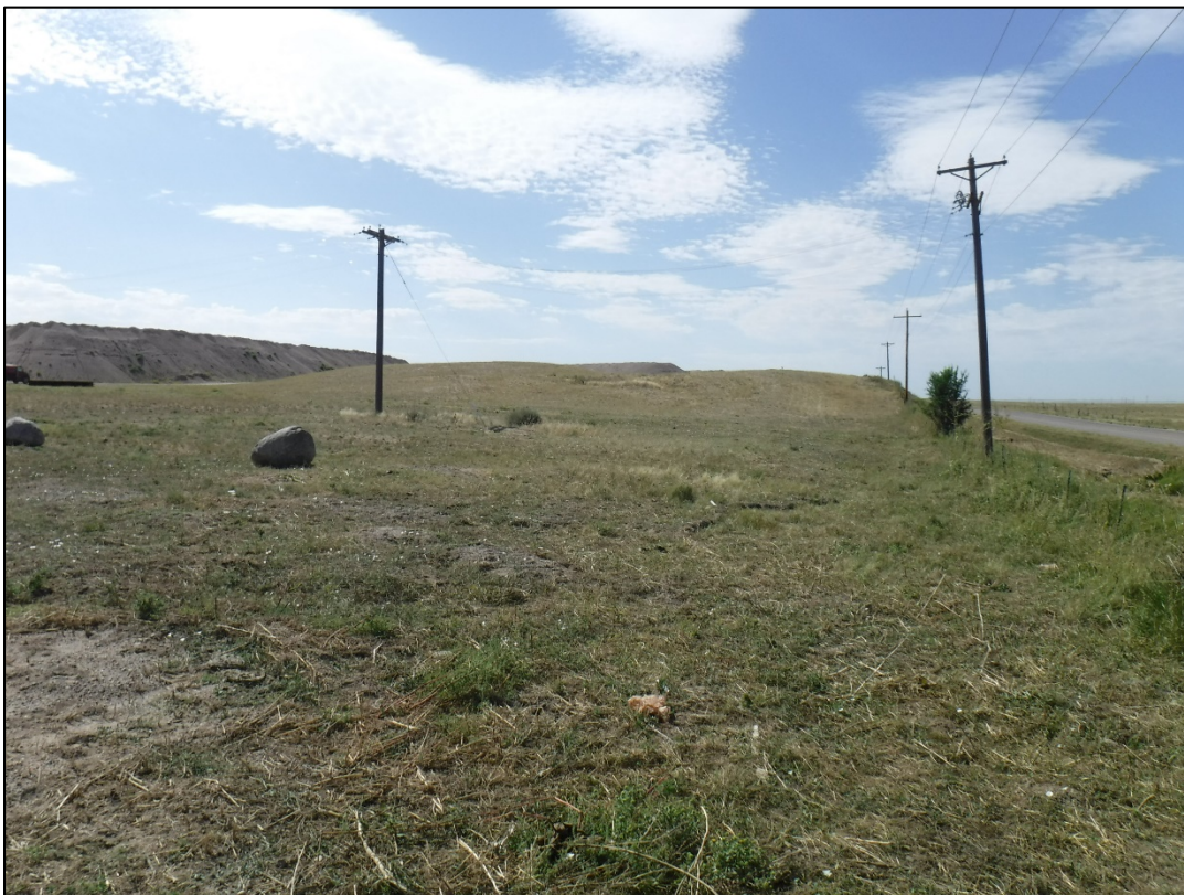
Photo 2: Looking south from the mine entrance, road at the center right of picture is 36 th Lane