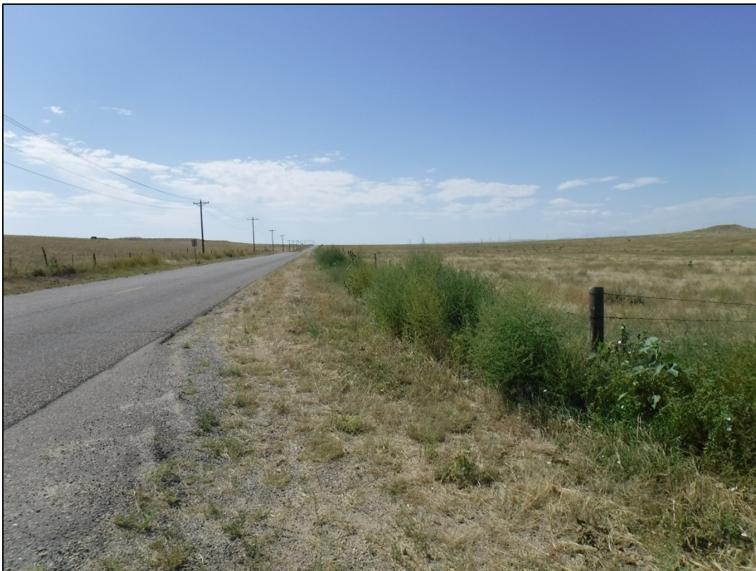
Photo 4: Kochia along mowed right-of-way across 36 th Lane from State Pit