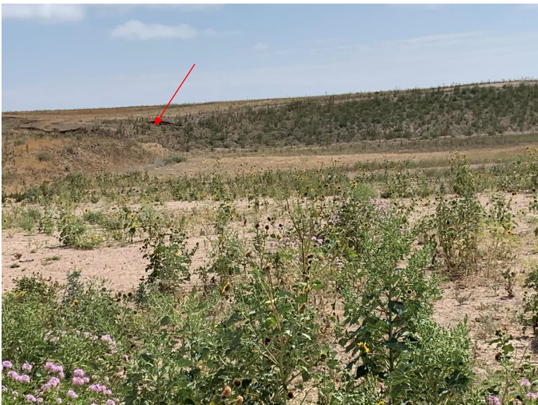
Photo 2 – Northeast corner of pit left as borrow pit for landowner.