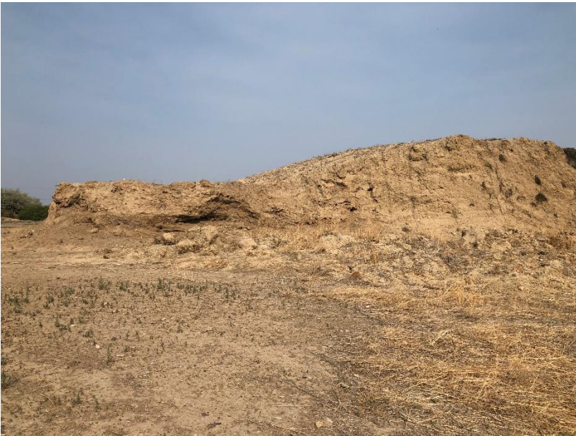
Topsoil pile requires protection from erosion