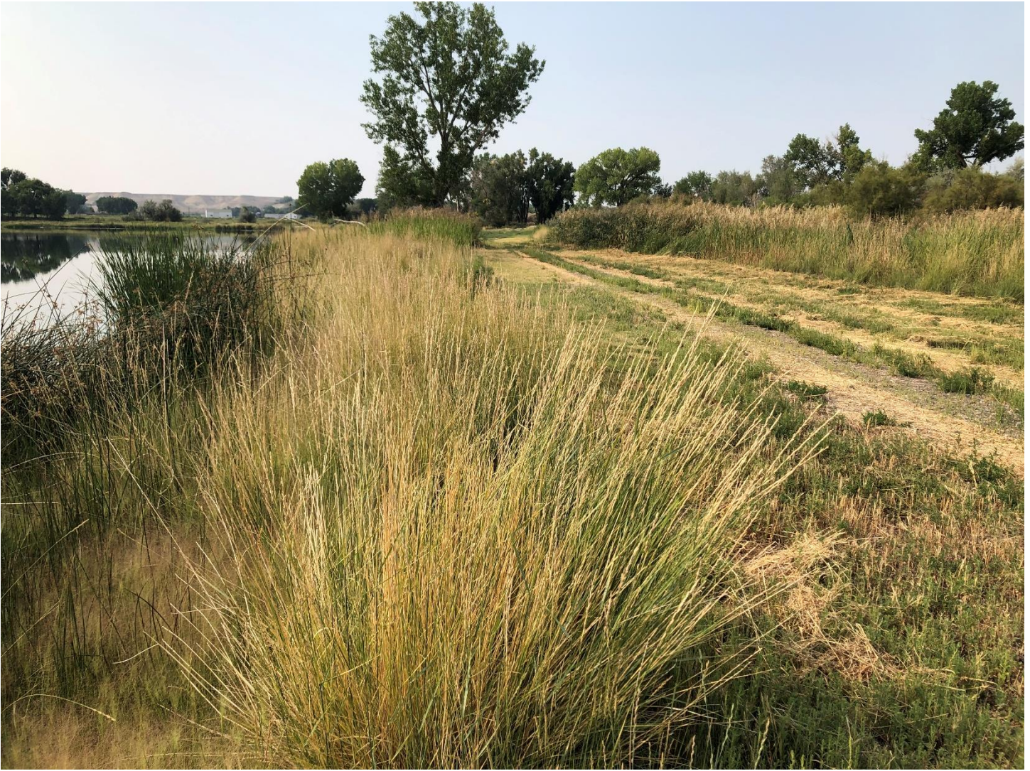
Reclaimed area at southwest side of pond