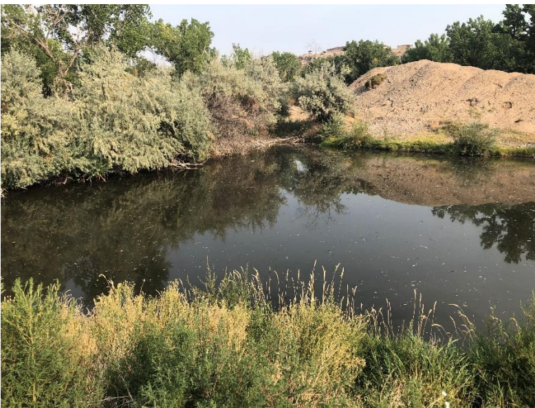
Weeds at north pond – Russian olive, tamarisk, knapweed