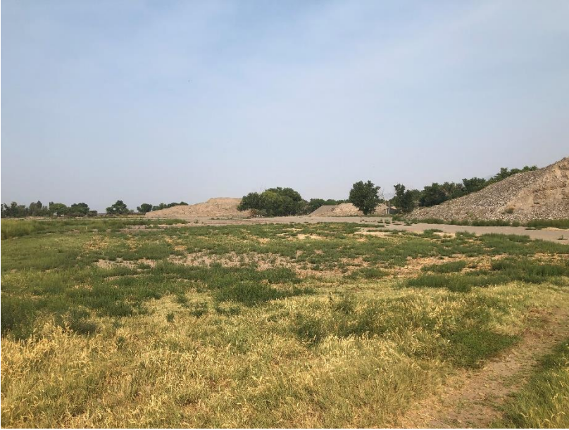
Pasture and stockpiles at southeast side of site