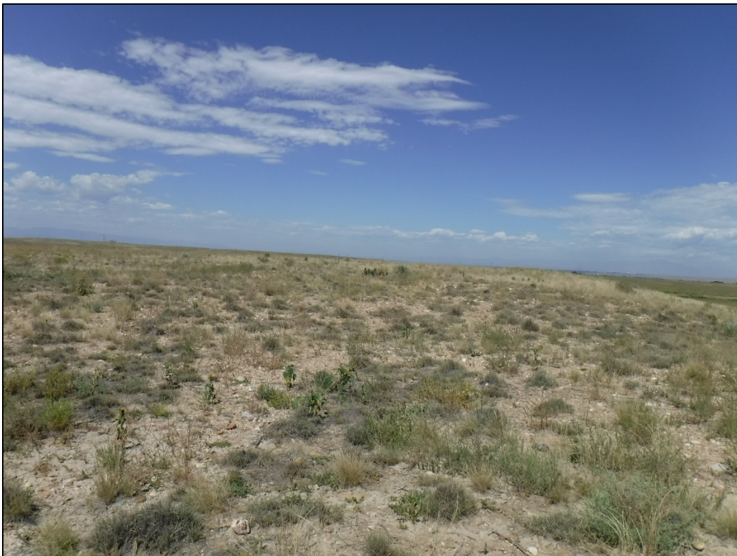
Photo 8: Typical vegetation conditions leading out on a gravel terrace