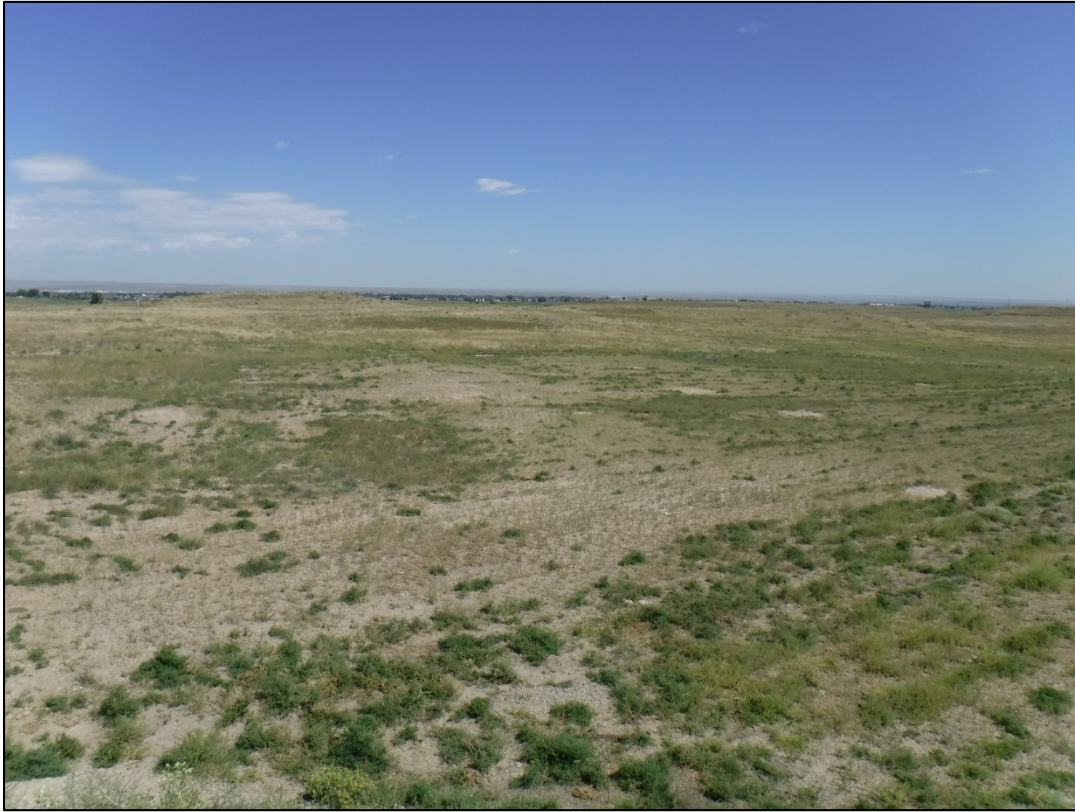
Photo 5: Looking north across the permit area from the top of stockpile