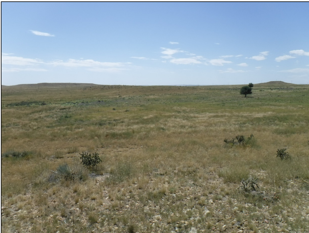
Photo 10: Vegetative conditions looking south from a gravel terrace