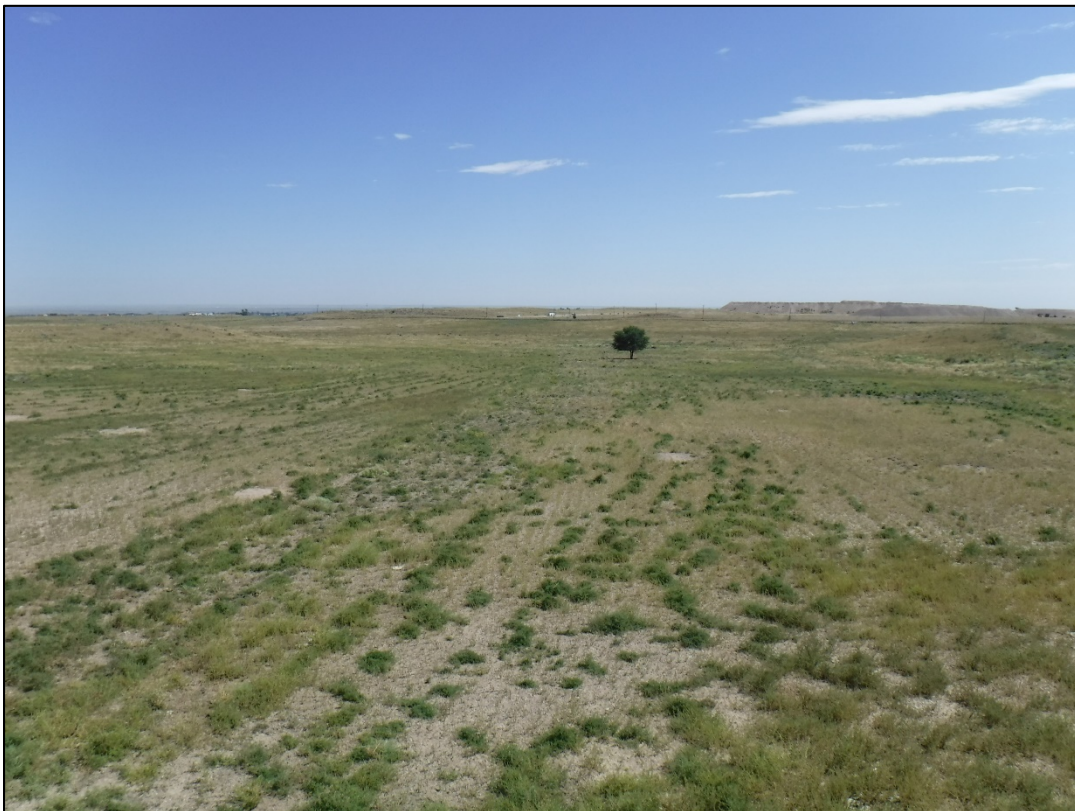
Photo 6: Looking east across the permit area towards the mine entrance from the stockpile