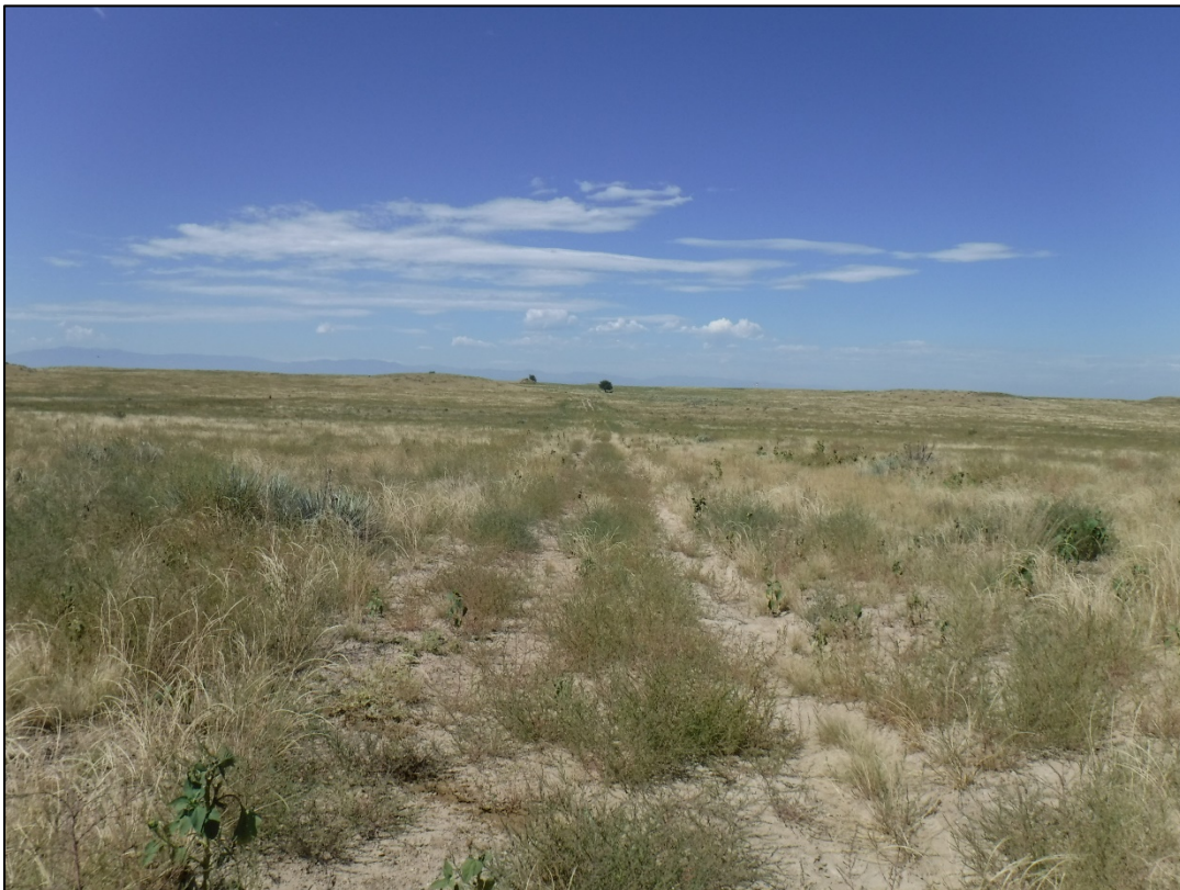
Photo 2: Looking west along the haul road towards the former mining/processing area