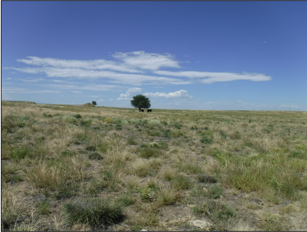
Photo 3: Typical conditions within the 19 acre re-seeded area, stockpile approved to remain is in the background