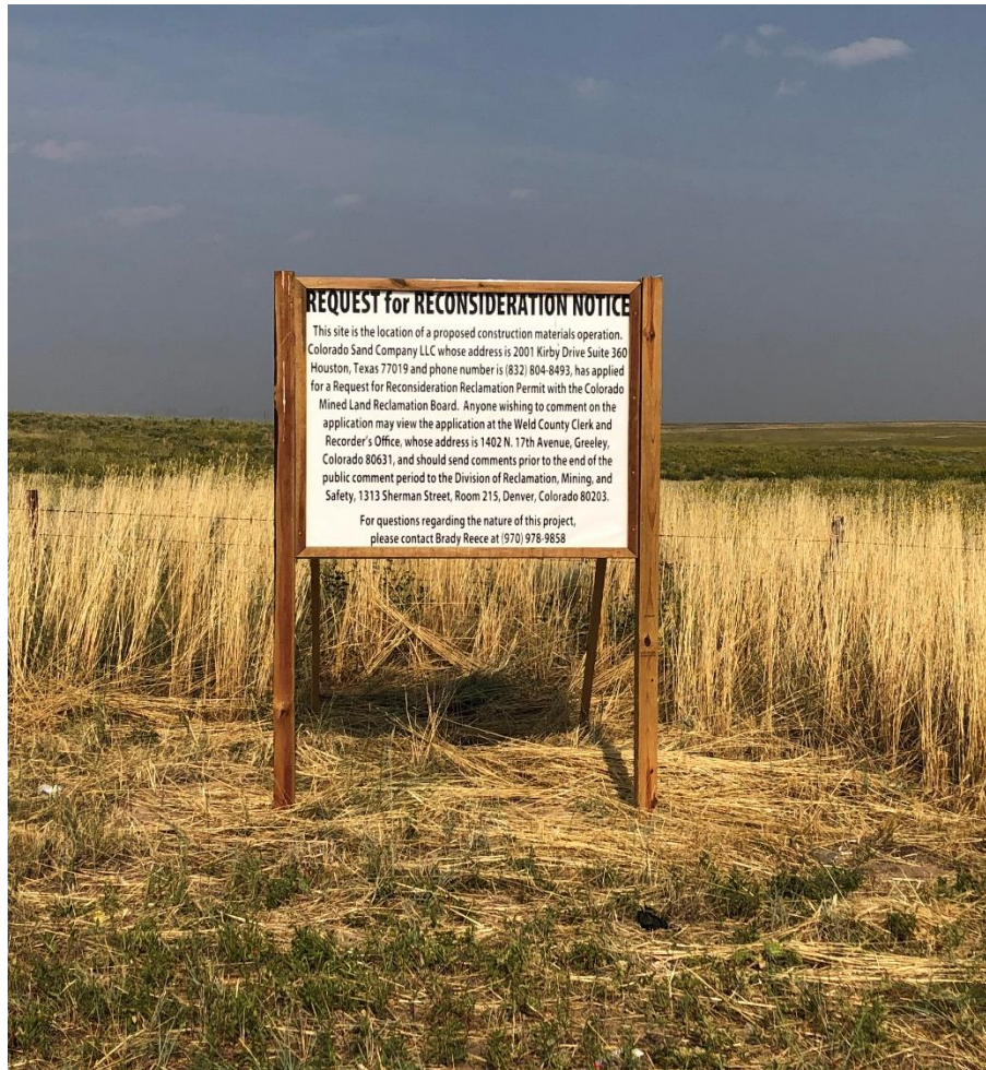
Sign No. 3