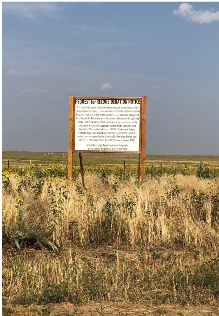
Sign No. 2