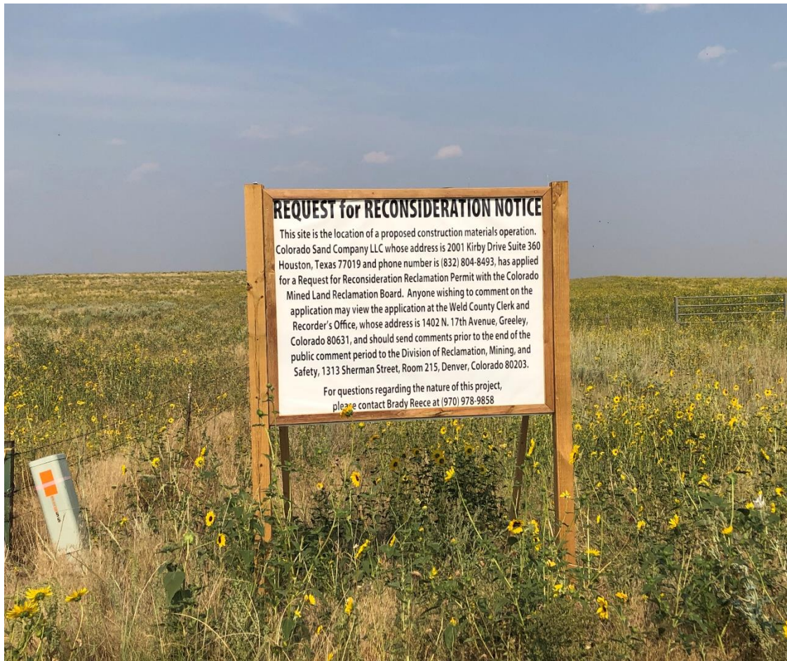
Sign No. 1