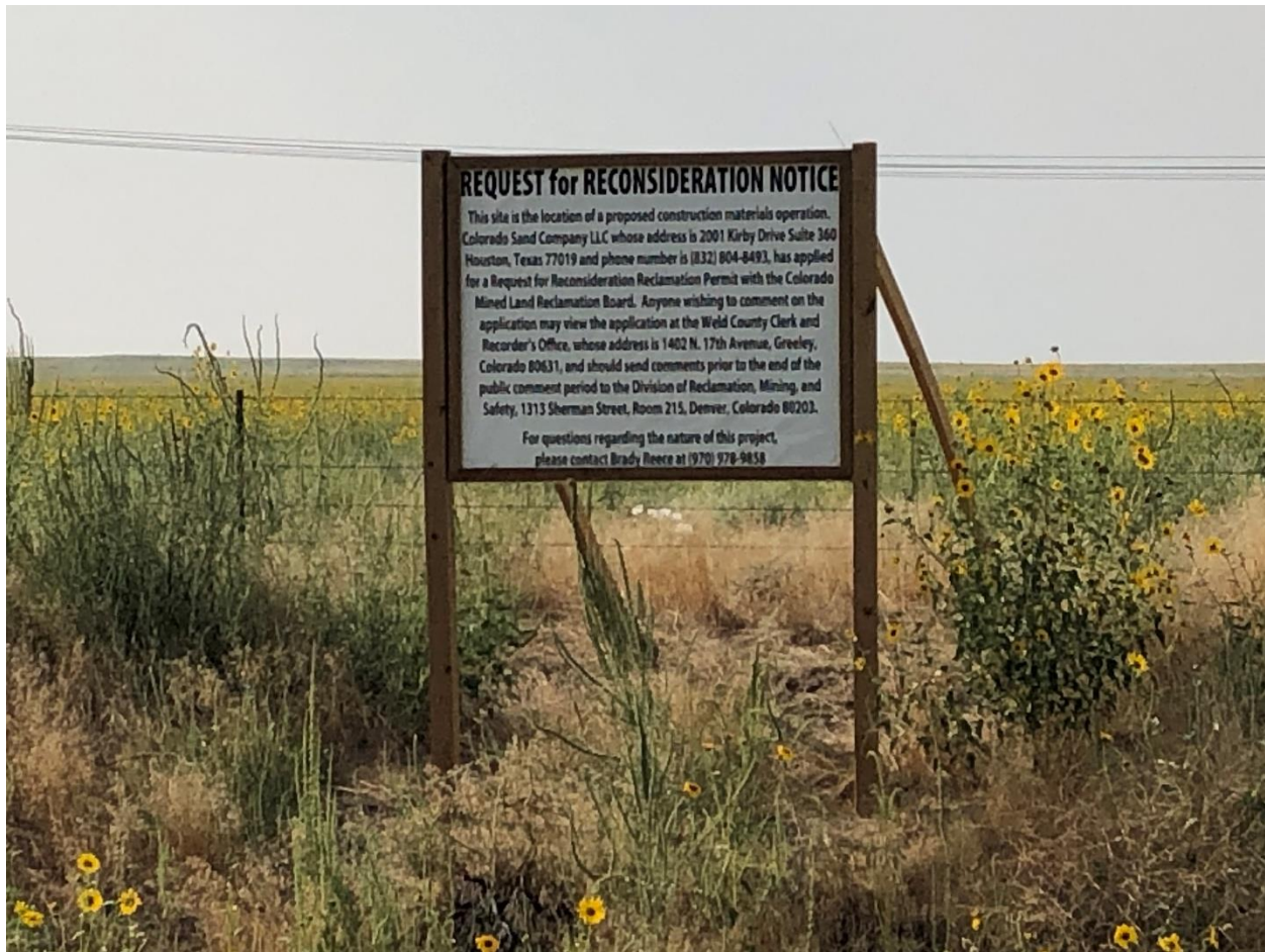
Sign No. 5