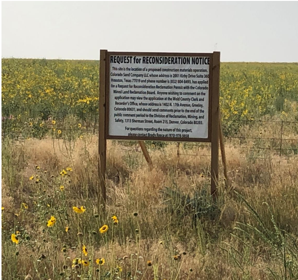
Sign No. 4