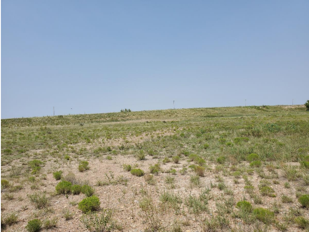
Small area without complete vegetation