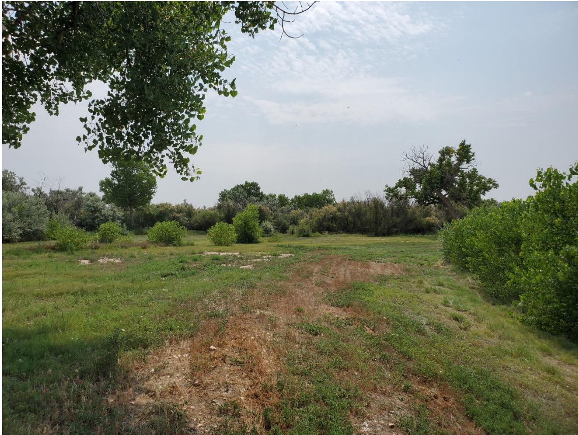
North Side of Pond Facing East