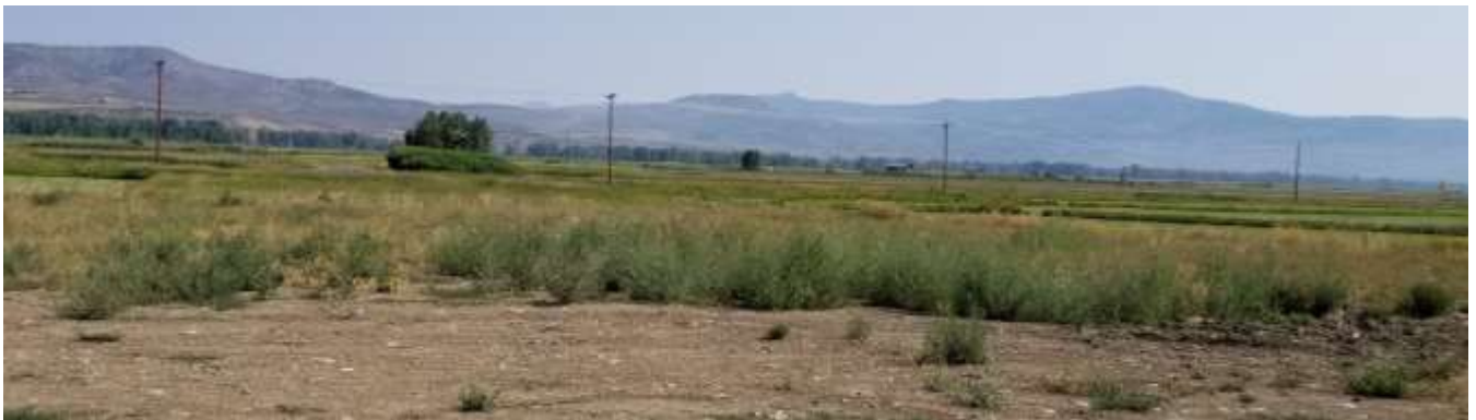
Weeds in parking lot shown below looking north.

Number of Partial Inspection this Fiscal Year: 8 Number of Complete Inspections this Fiscal Year: 3