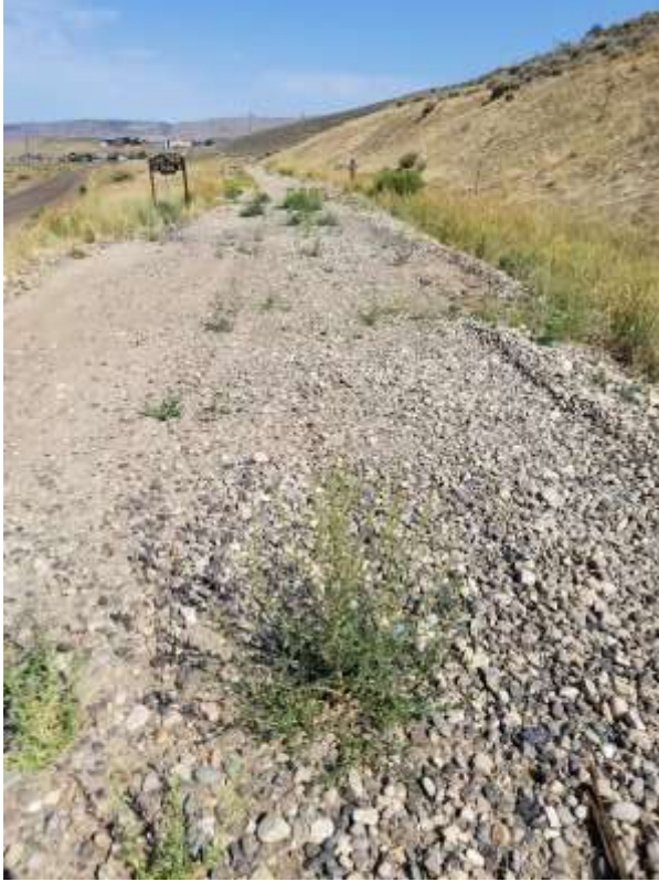
Weeds on trail shown above.