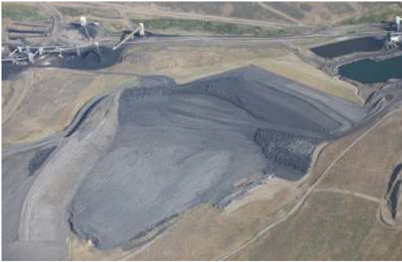
Photo above shows the waste pile, pond D and the pit pond at the top right, pond B at the top left. Ponds B and D appear to need to be cleaned. No issues are noted with the waste pile.