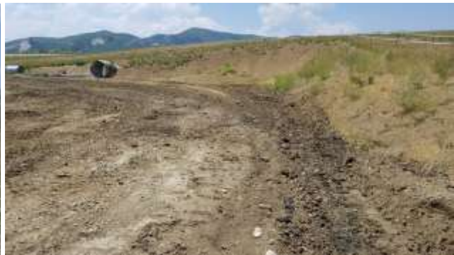
Coal fines have been cleaned up on the pad.