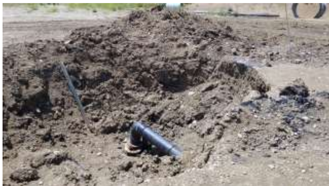
12 L borehole is no longer backing up and pad will be reclaimed per operator.