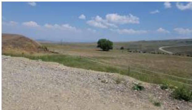
Electric fence at 12L shown above

The 12L borehole pad was checked for clean-up and reclamation progress. An electric fence has been placed around the 12L pad and topsoil pile.