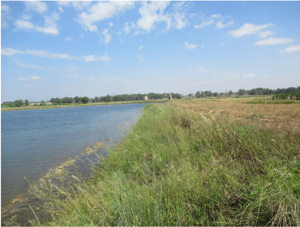
View of the eastern shoreline of Cell 3 looking north