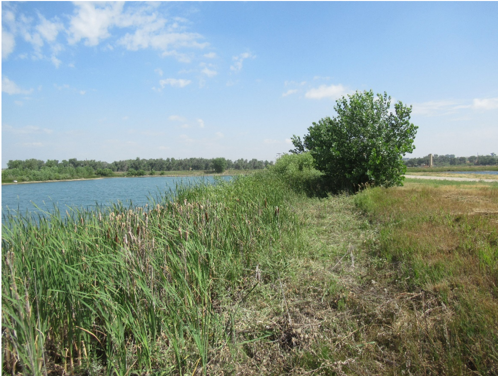
View of the eastern shoreline of the western portion of Cell 2 looking north