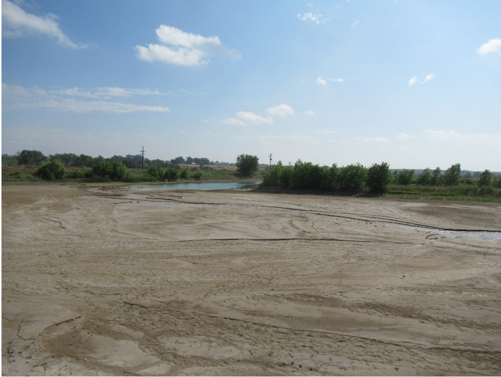
View of the wash fines in the north half of the middle portion of Cell 2