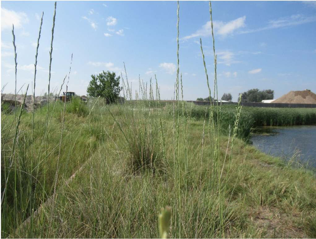
View of the vegetation along the eastern shore of Cell 1