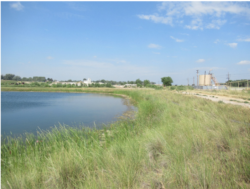
View of the northern shoreline of Cell 3 looking west