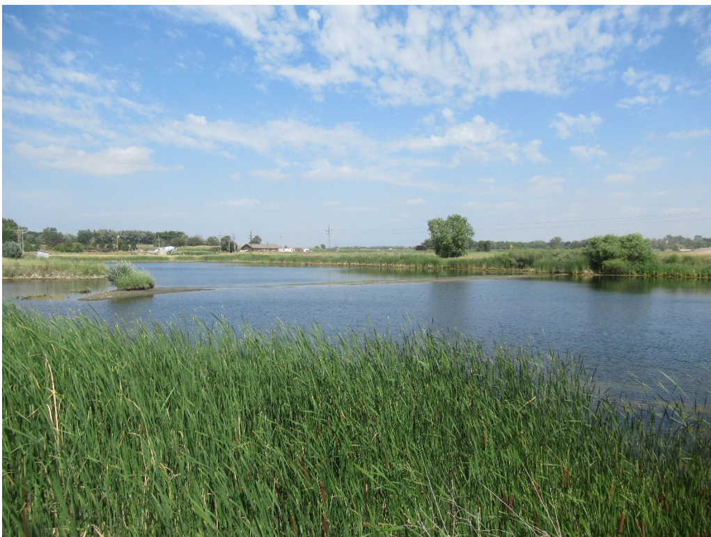
View of Cell 1 from the southeast corner looking northwest