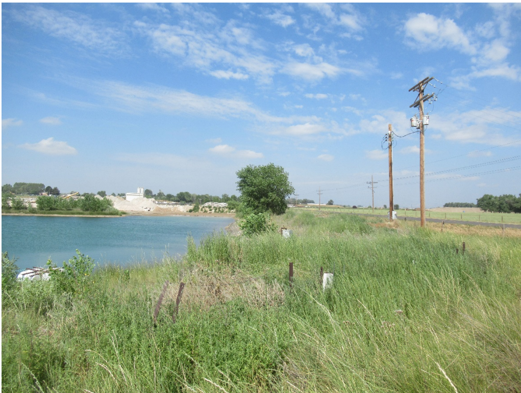
View of the northern shoreline of the western portion of Cell 2 looking west