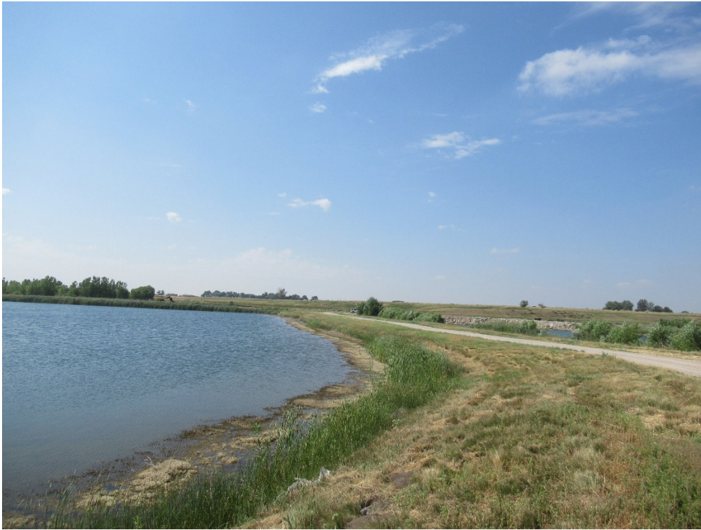
View of the western shoreline of Cell 3 looking south