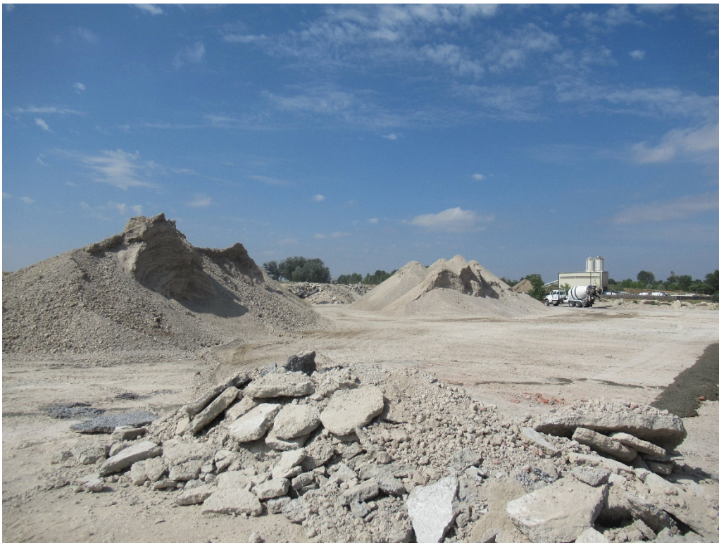
View of the concrete recycling operation in the western portion of Cell 2