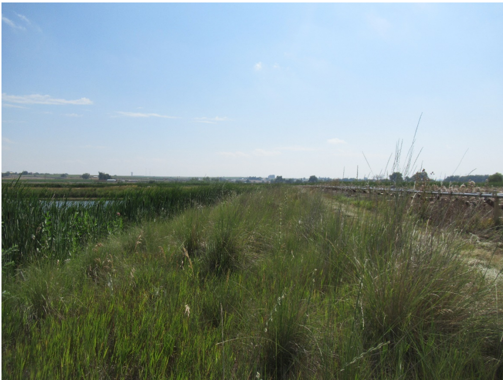
View of the southern shoreline of Cell 3 looking east