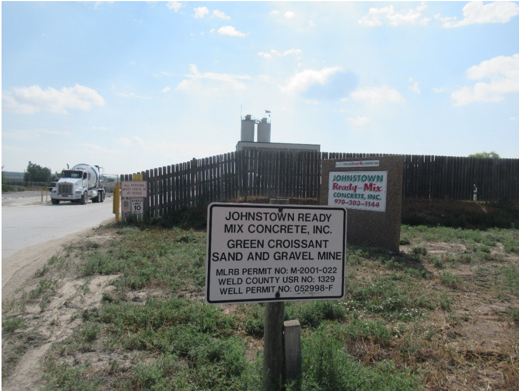
Green Croissant mine sign