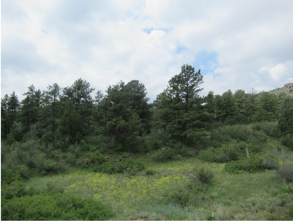
View of Parcel H2 looking north