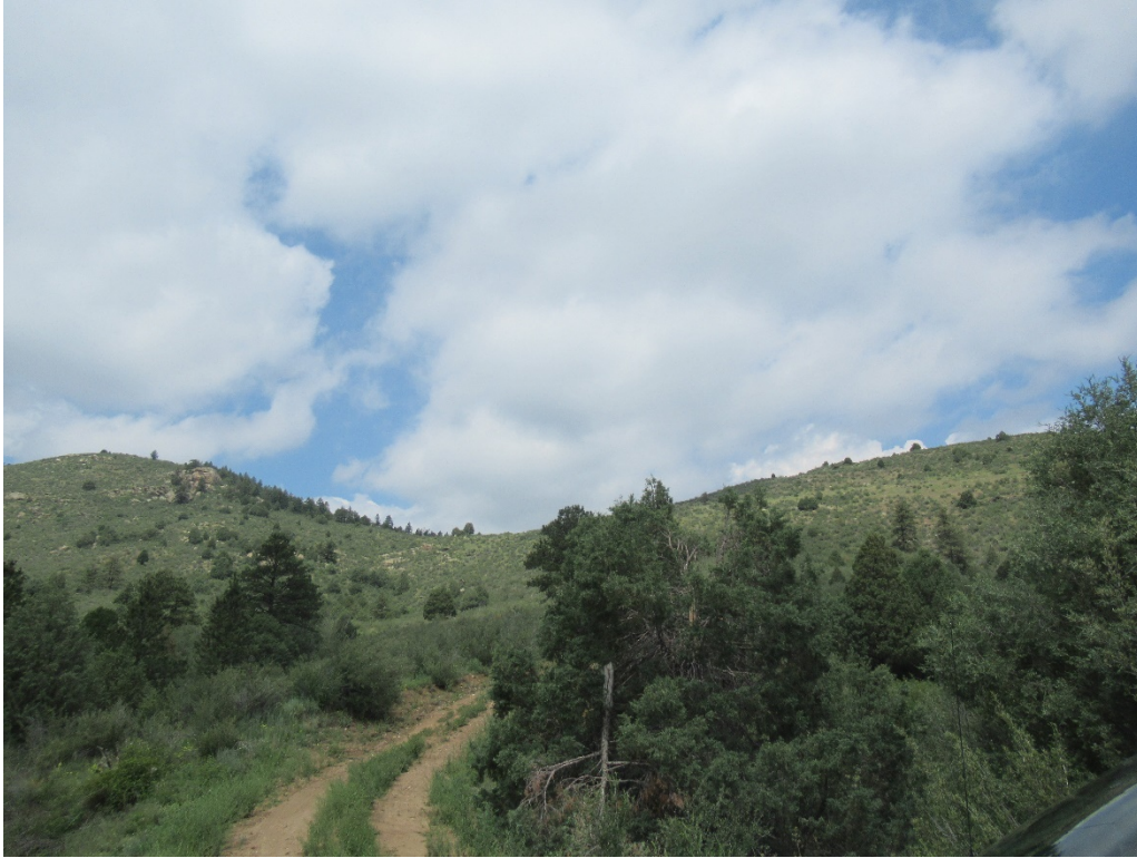
View of Parcel J looking north