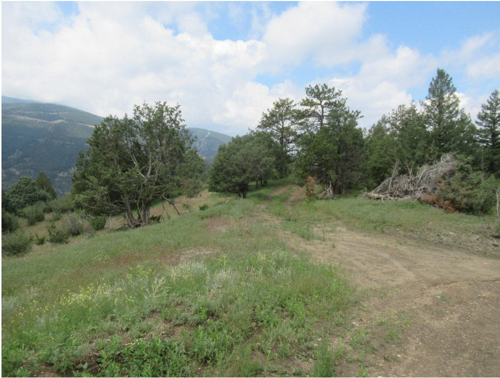
View of Parcel H2