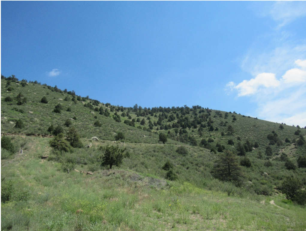
View of Parcel A1 from the jeep road looking northeast