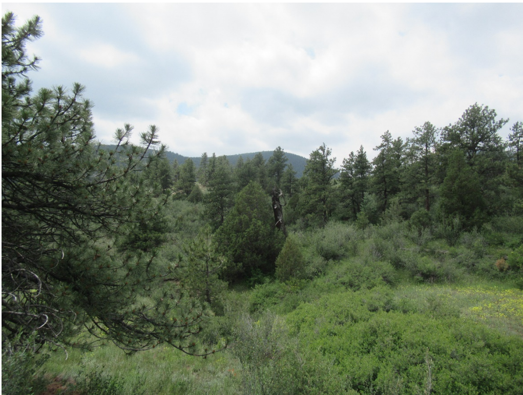
View of Parcel H2 looking west