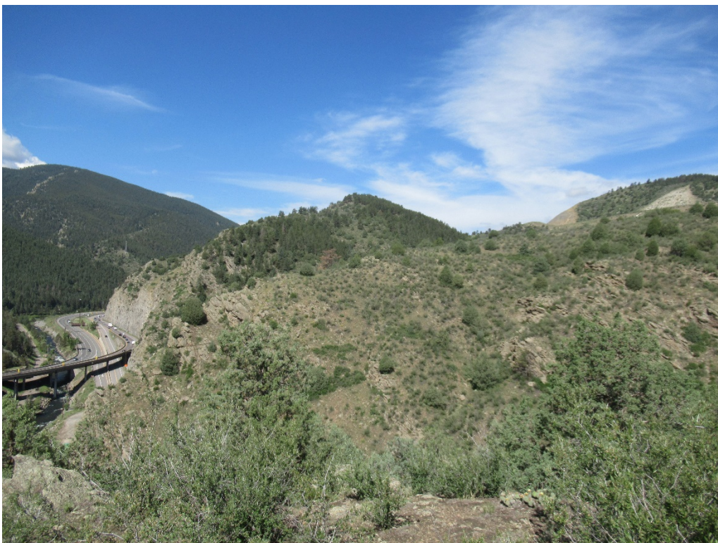
View of Parcel B2 from the center of the parcel looking west