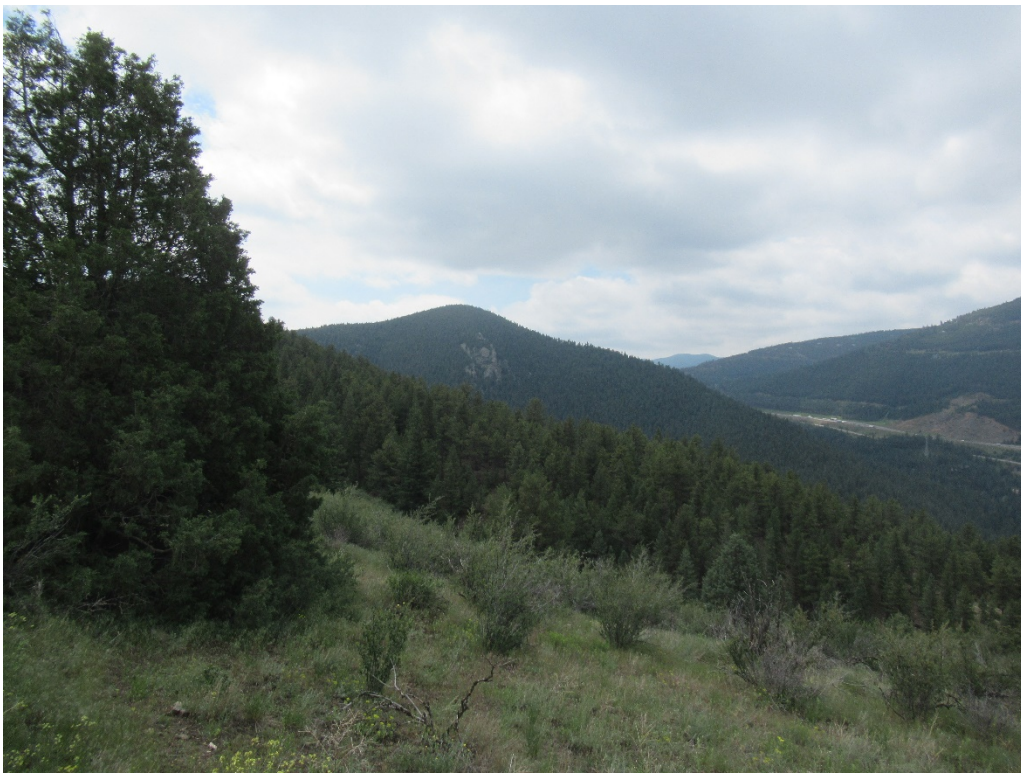
View of Parcel H2 looking southeast