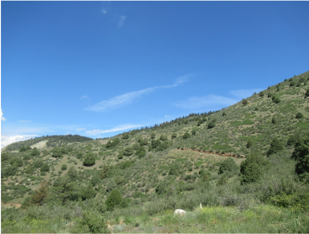
View of Parcel A1 from the jeep road looking northwest