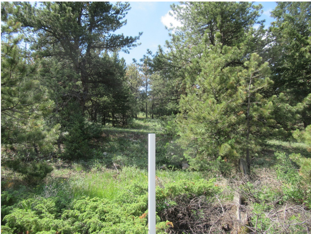
View of Parcel F from the northeast corner looking south