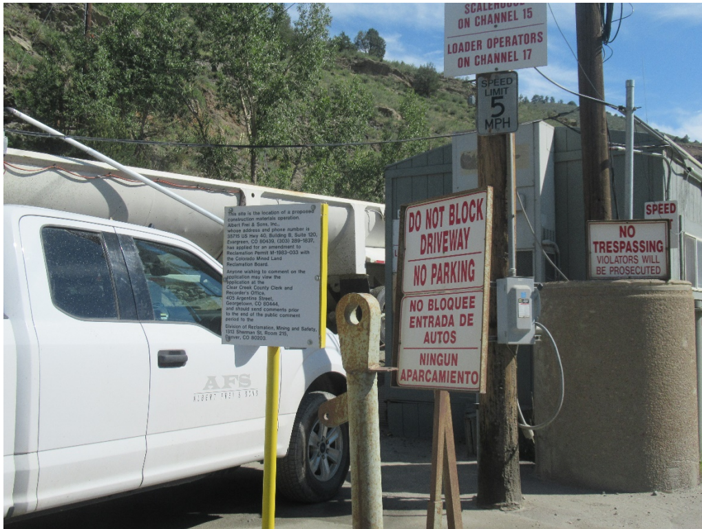
Walstrum Quarry amendment notice sign