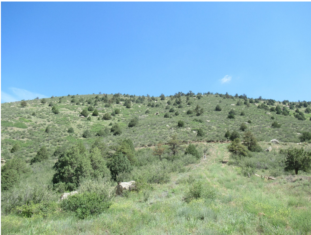
View of Parcel A1 from the jeep road looking north