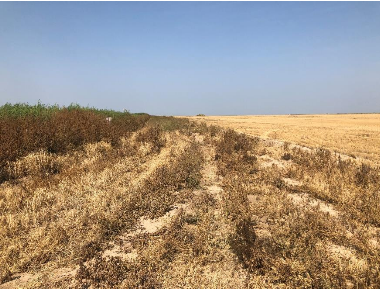
Entrance road, taken at the intersection at J Road