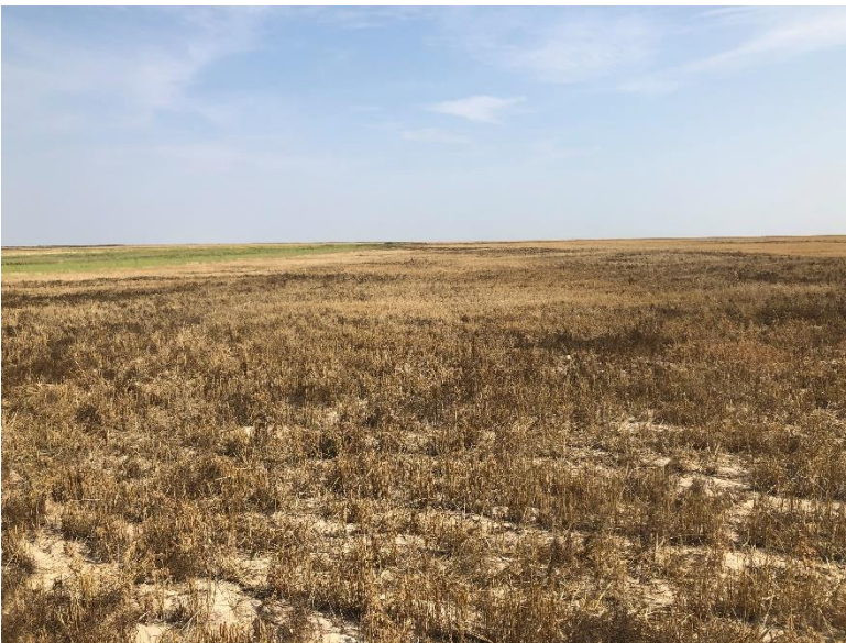
Southeast corner of site, looking north