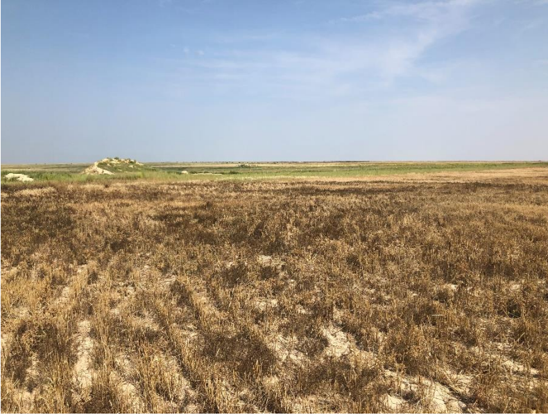
Area around test pits, south side of site