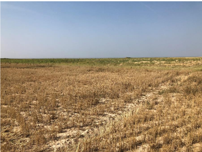
Northeast corner, looking southwest (wheat stubble in foreground)