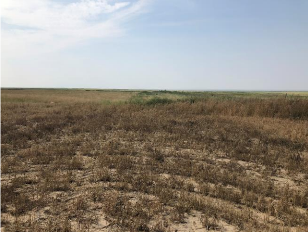
Northwest corner, looking south – fence posts are approximately 100 feet west of proposed permit area