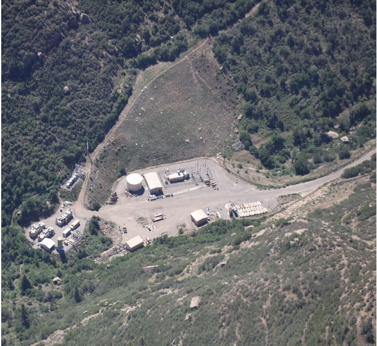
Figure 3: Upper facilities area

Number of Partial Inspection this Fiscal Year: 2