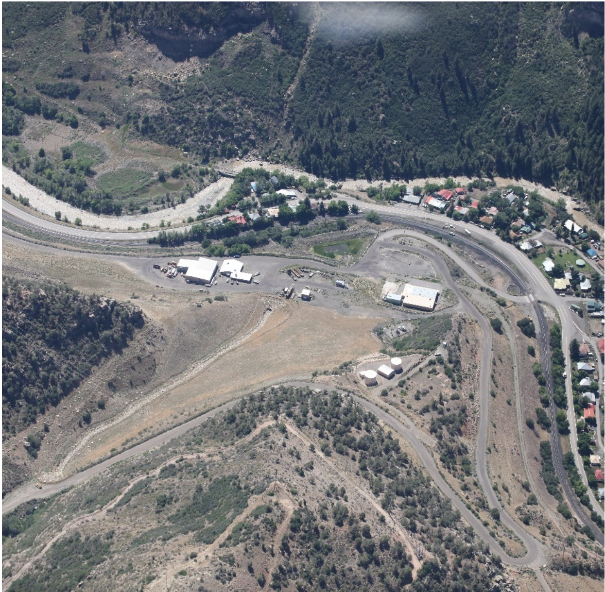
Figure 1: Lower facilities area

Number of Partial Inspection this Fiscal Year: 2