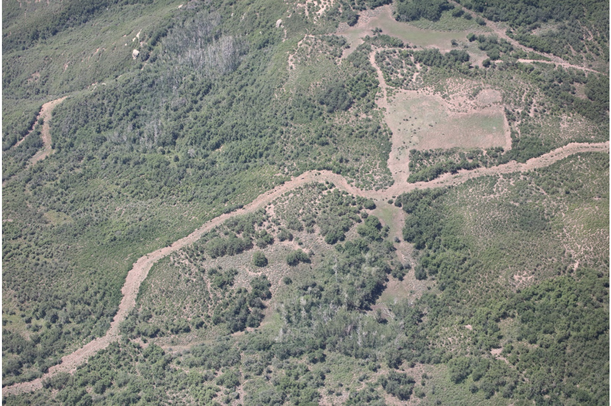
Figure 5: Reclaimed CBM-8/11/13 pad and road

Number of Partial Inspection this Fiscal Year: 2