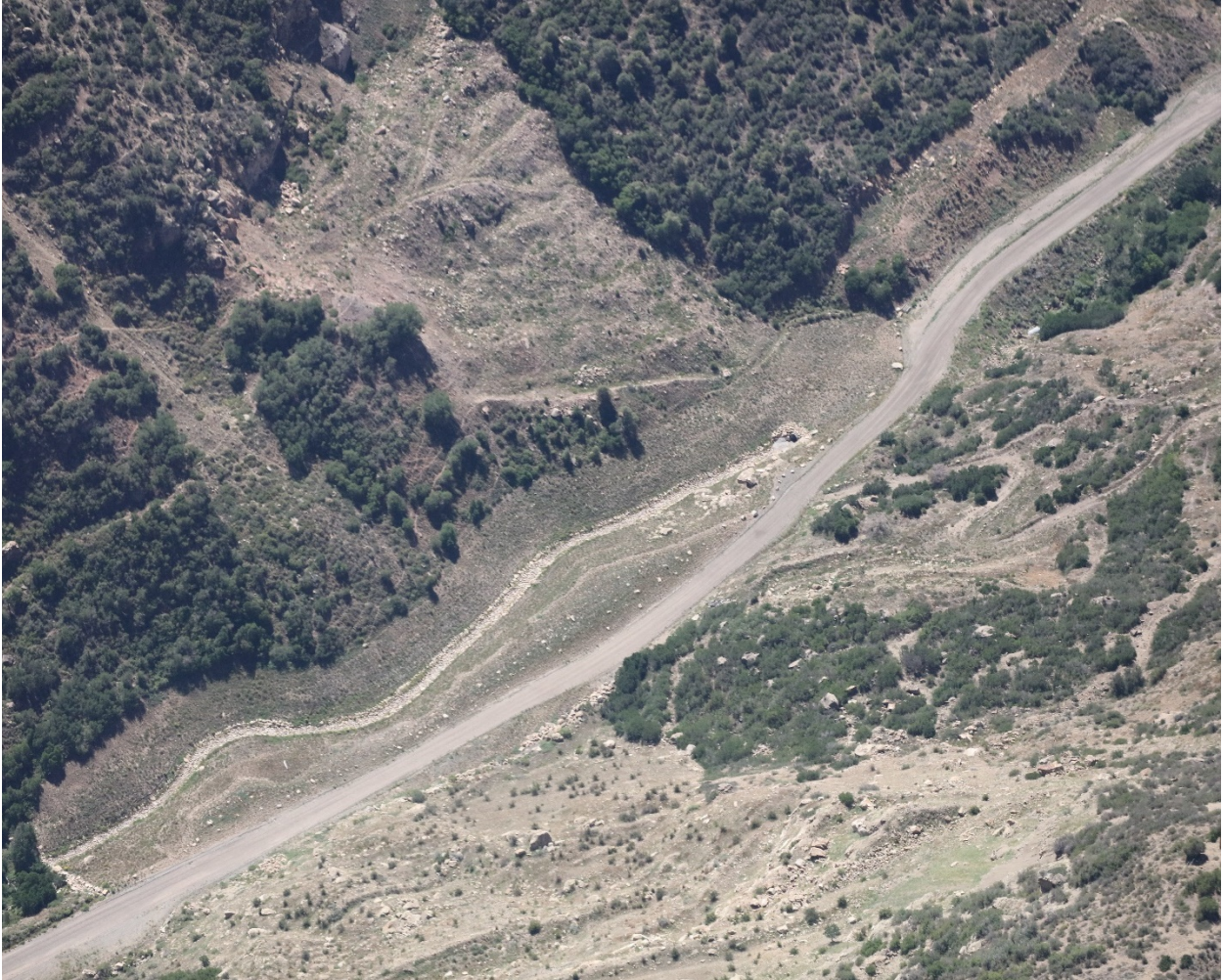
Figure 2: Upper section of reclaimed Elk Creek channel

Number of Partial Inspection this Fiscal Year: 2