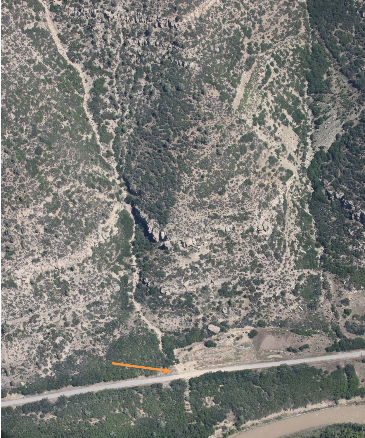
Figure 10: Lower section of B-gulch, with landslide debris near old Highway 133

Number of Partial Inspection this Fiscal Year: 2