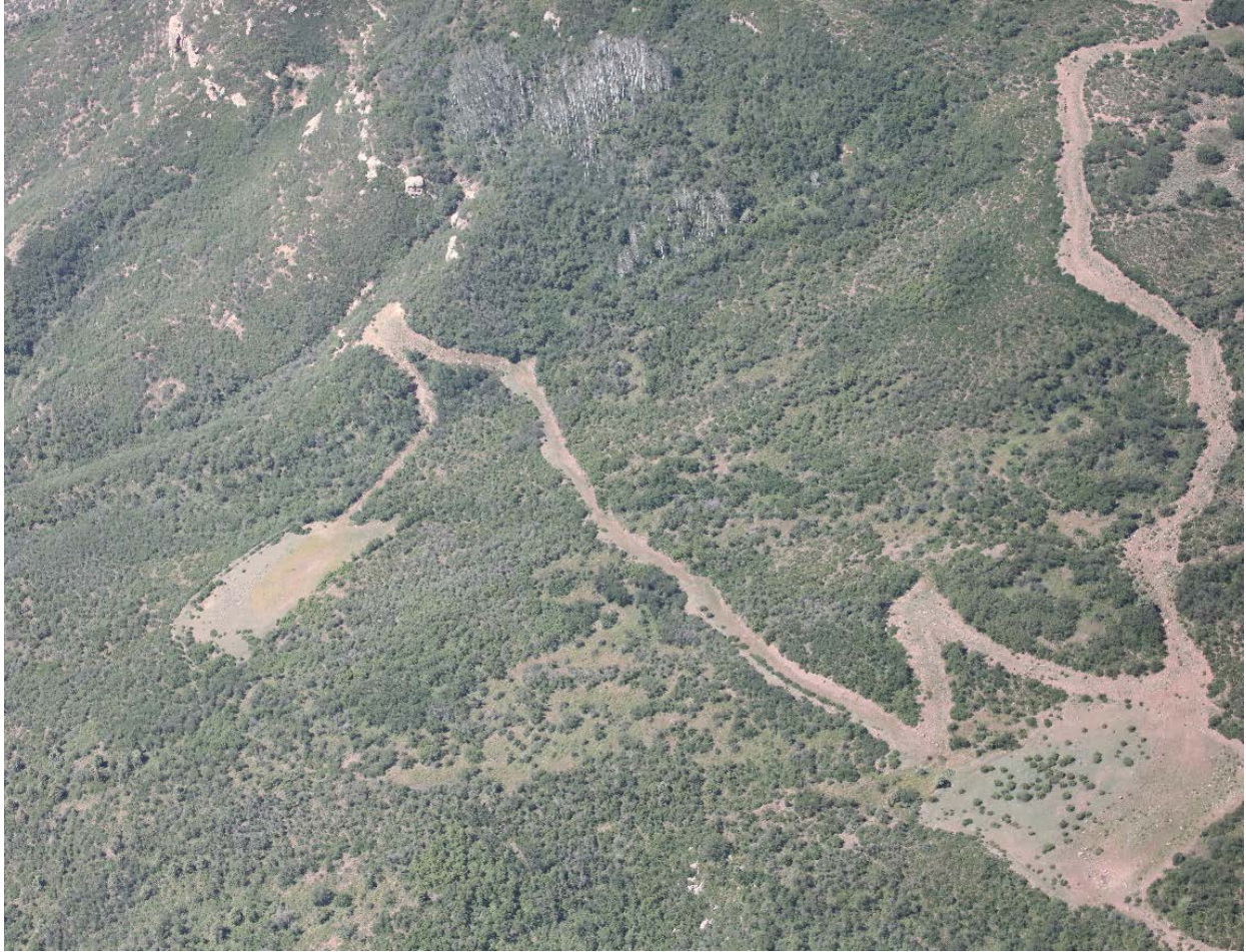
Figure 7: CBM-4/5 pad (left of frame)

Number of Partial Inspection this Fiscal Year: 2