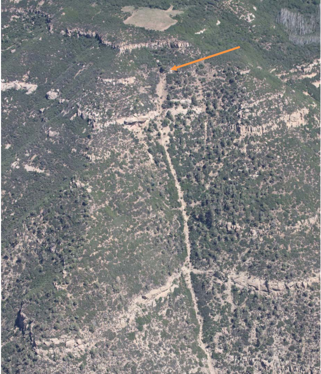
Figure 9: Rockfall/landslide in B-gulch

Number of Partial Inspection this Fiscal Year: 2