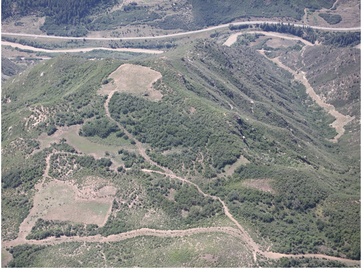
Figure 4: Reclaimed CBM-9/10/12/14 and CBM-8/11/13 (foreground) pads, with reclaimed A-gulch disturbance to the right of the frame

Number of Partial Inspection this Fiscal Year: 2