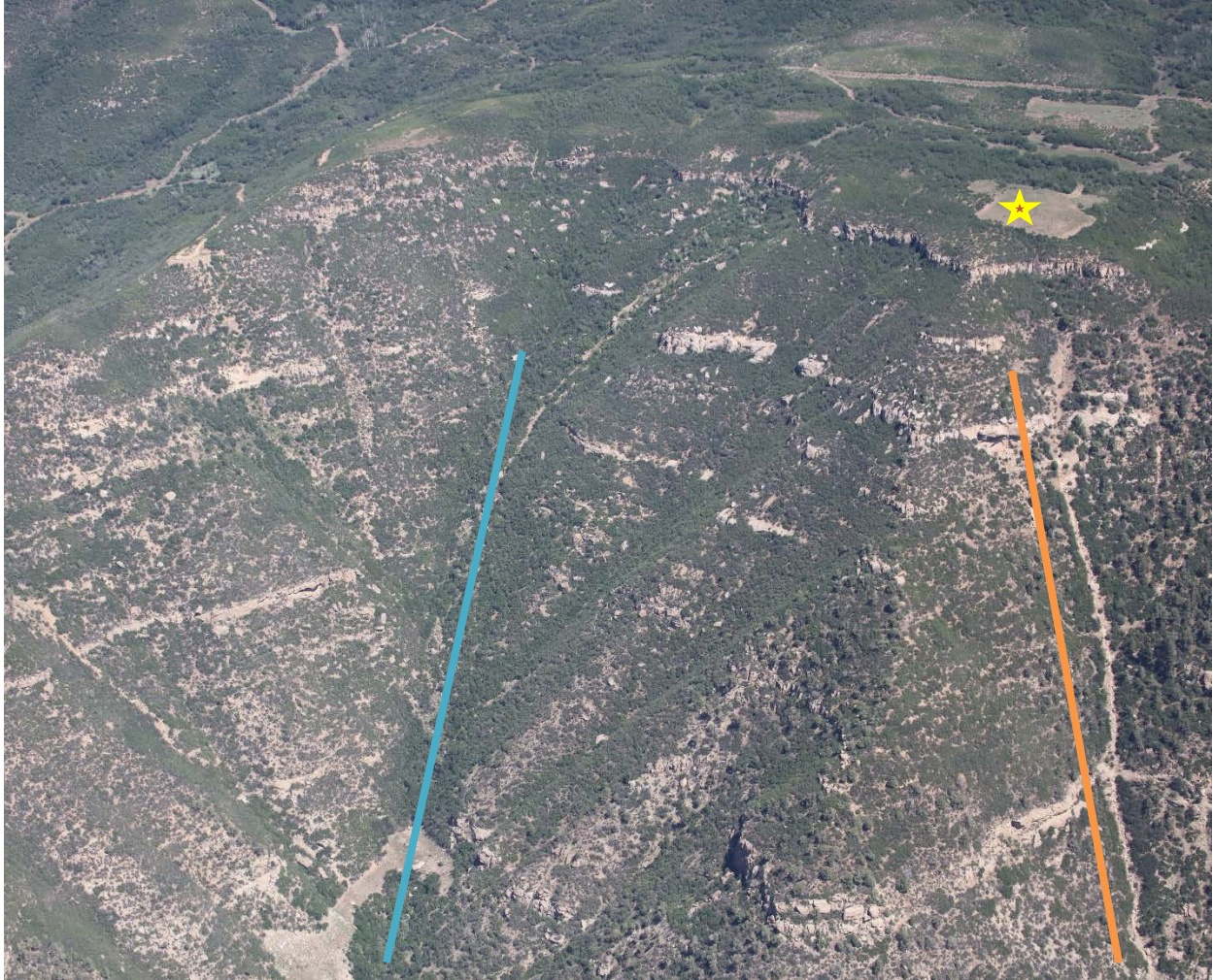
Figure 8: A-gulch (blue), B-gulch (orange) and CBM-9/10/12/14 pad (yellow)

Number of Partial Inspection this Fiscal Year: 2