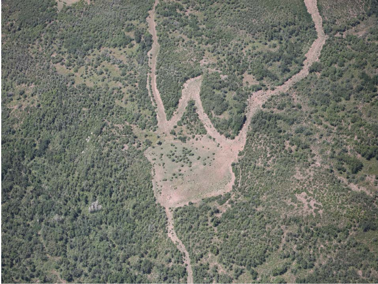
Figure 6: CBM-1/2/3/6/7 pad and road

Number of Partial Inspection this Fiscal Year: 2