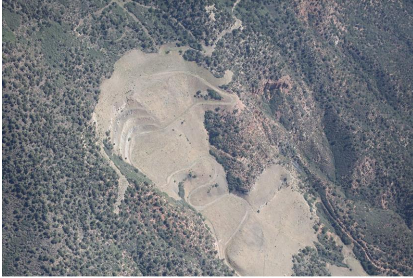
Upper part of East Mine