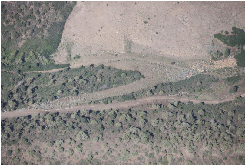
West Mine ponds

Number of Partial Inspection this Fiscal Year: 1