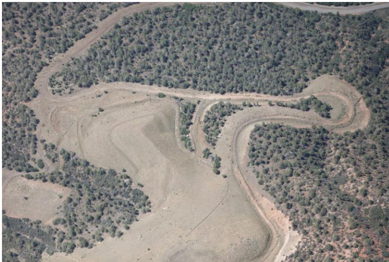
Lower part of East Mine

Number of Partial Inspection this Fiscal Year: 1