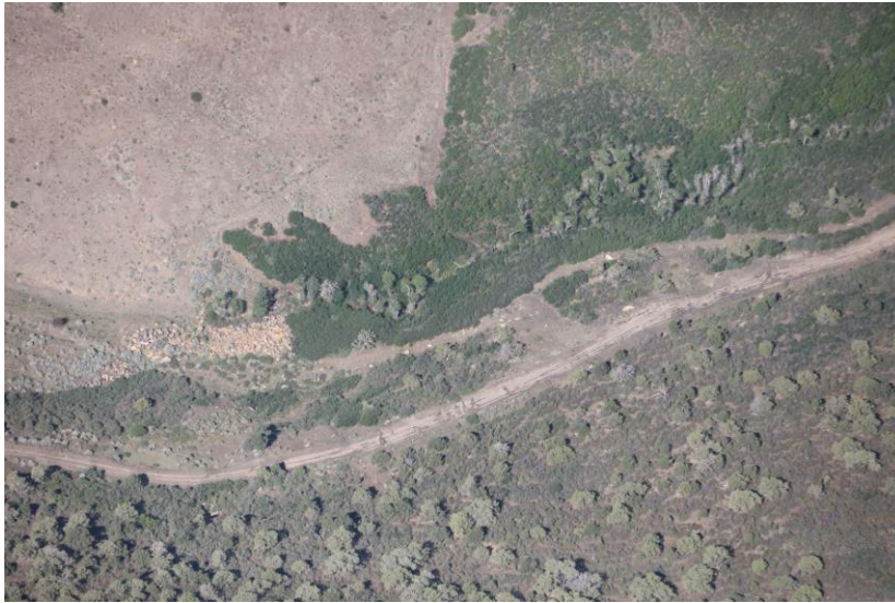
Lower part of West Mine, including buttness