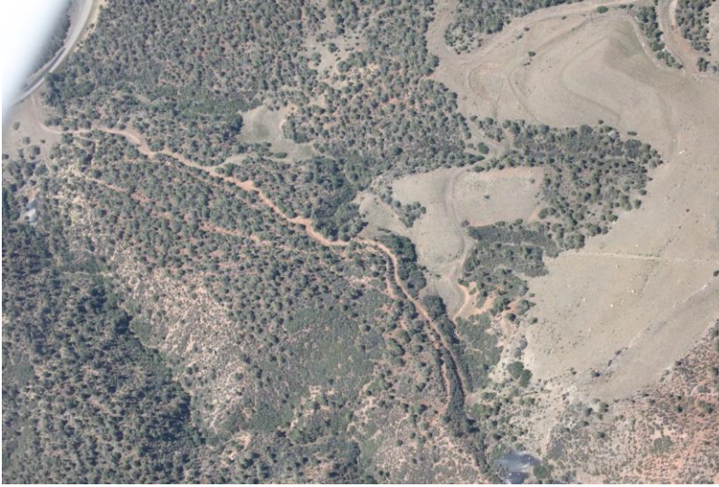
East Mine – Old Waste Disposal Area and reclaimed ponds