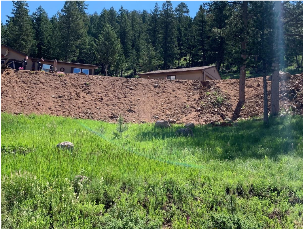
Photo 4 – South section of backfilled parking area from below, facing east.