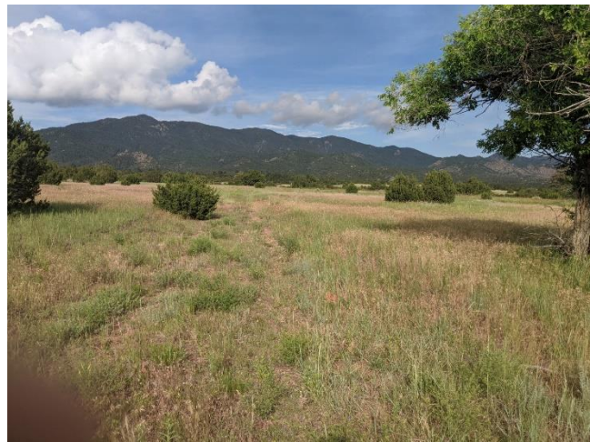
NW-MW well access road.