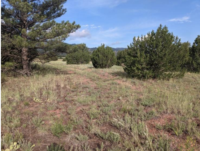
Two track road.