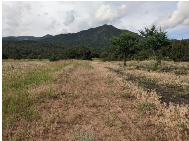
Access road to substation.

The NW-MW well pad shows good signs of vegetation. No erosion or issues were observed.