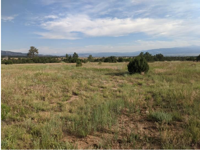
NW-MW well pad.