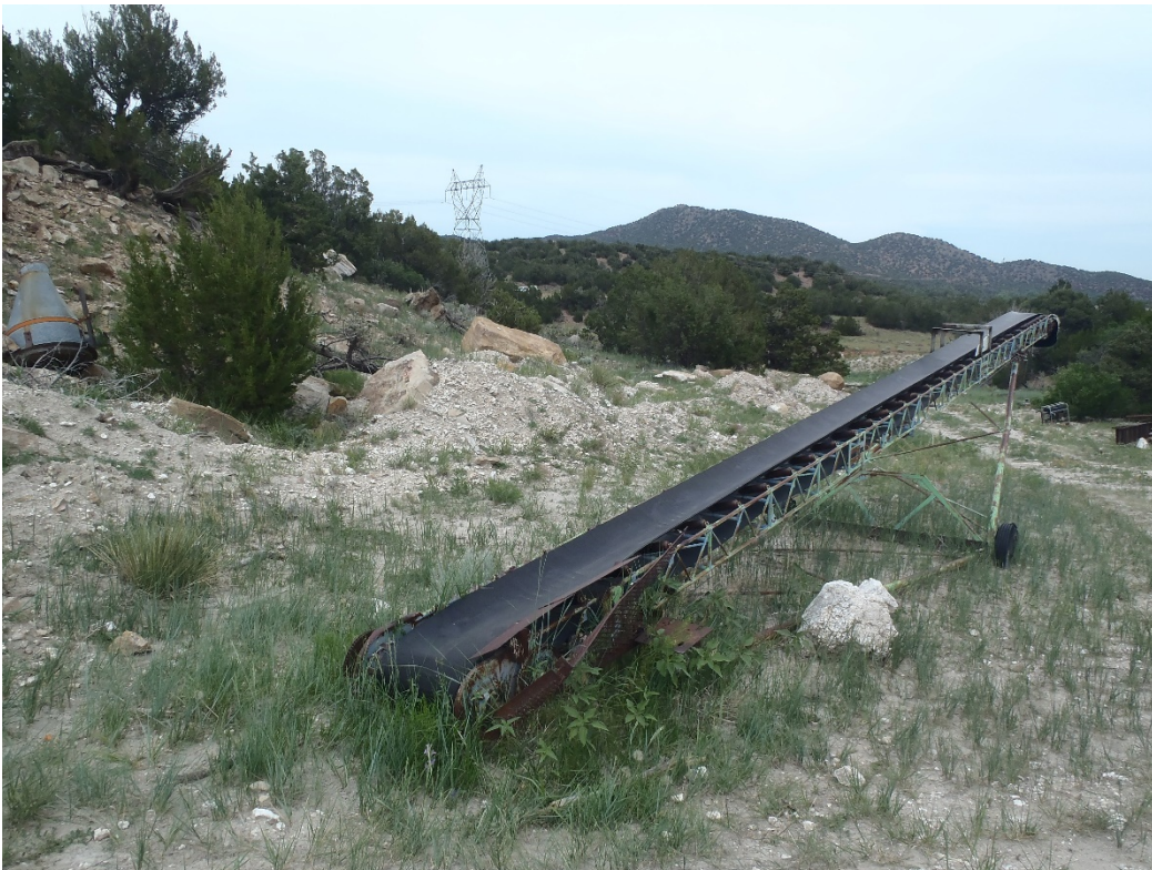
Photo 3. Conveyor along entrance road (looking NE – note powerline in background).