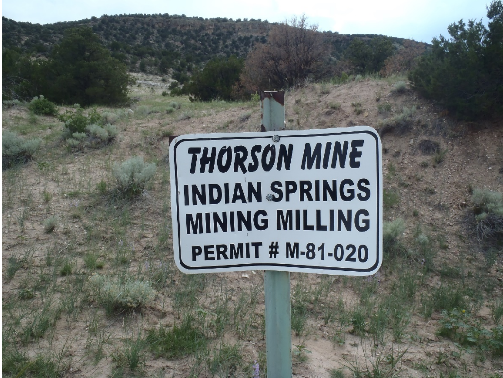
Photo 4. Permit sign Screen (looking south from NW corner on access road).

Ina Finch Indian Springs Ranch, LLP 3257 CR 67 Penrose, CO 81240