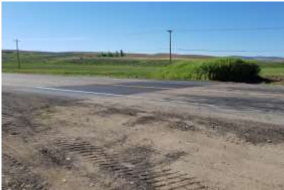
Hwy 40 patch where tracks were removed

The remaining tracks crossing Hwy 40 have been removed. The area north of Hwy 40 appears to have been graded. The trail was being used by runners at the time of inspection.