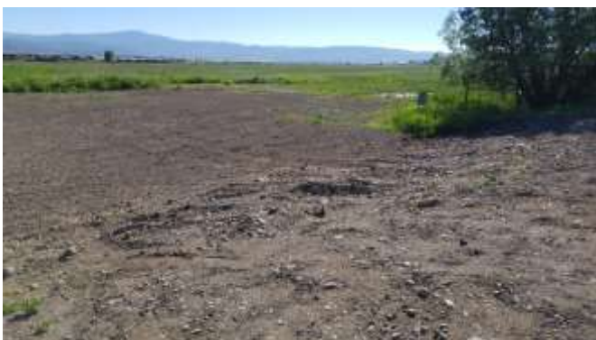
Looking north from Hwy 40.

Number of Partial Inspection this Fiscal Year: 8