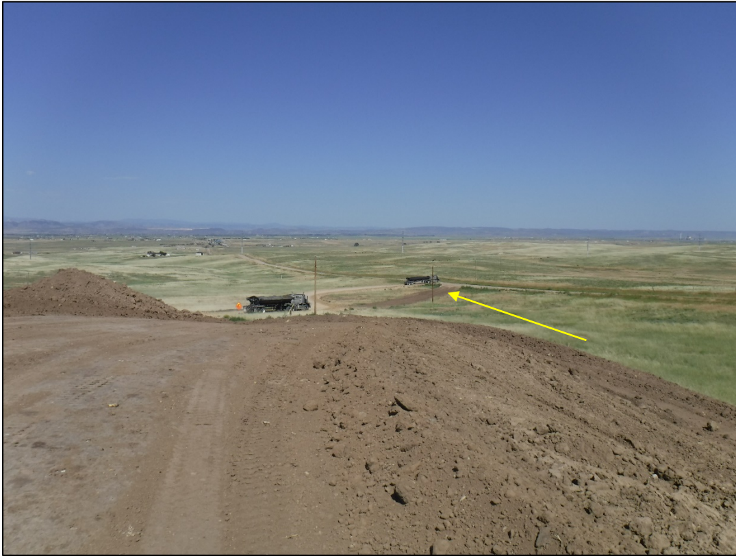
Photo 1: Looking west from pit, haul trucks on Weld County approved haul road leaving pit, arrow points to haul road affected prior to county realignment request