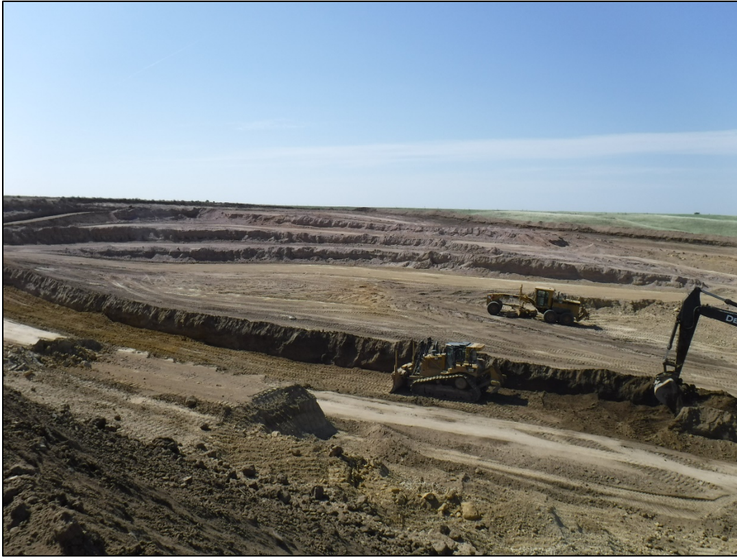
Photo 3: Lighter colored material in center of picture will be the last material removed prior to beginning reclamation