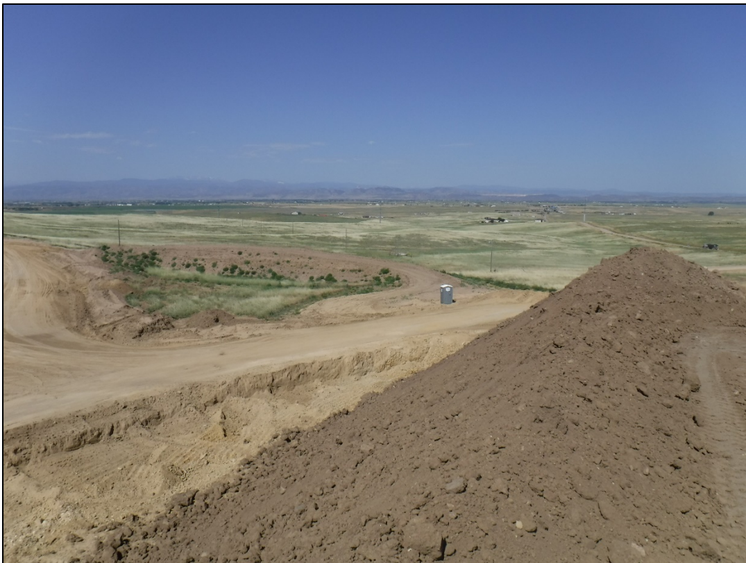
Photo 4: Darker material to the right of picture is going to be incorporated into reclamation as a growth medium