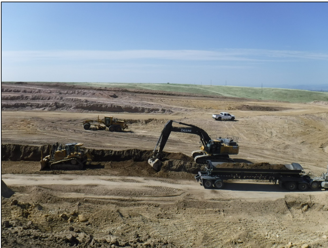
Photo 2: Current mining activities being performed under M2021-031