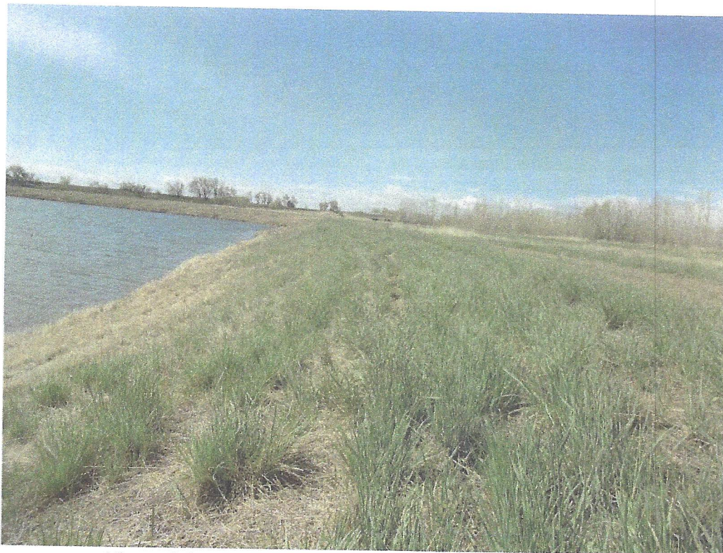
View of the vegetation in the southwest corner of Cell 4