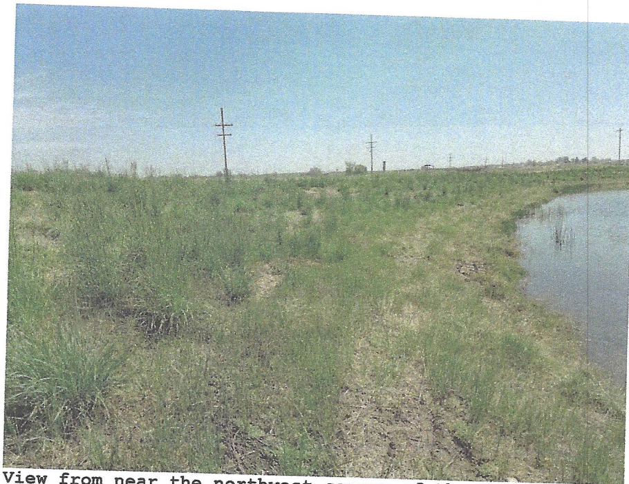
Figure 10. View from near the northwest corner of the Cell No. 4 looking east.