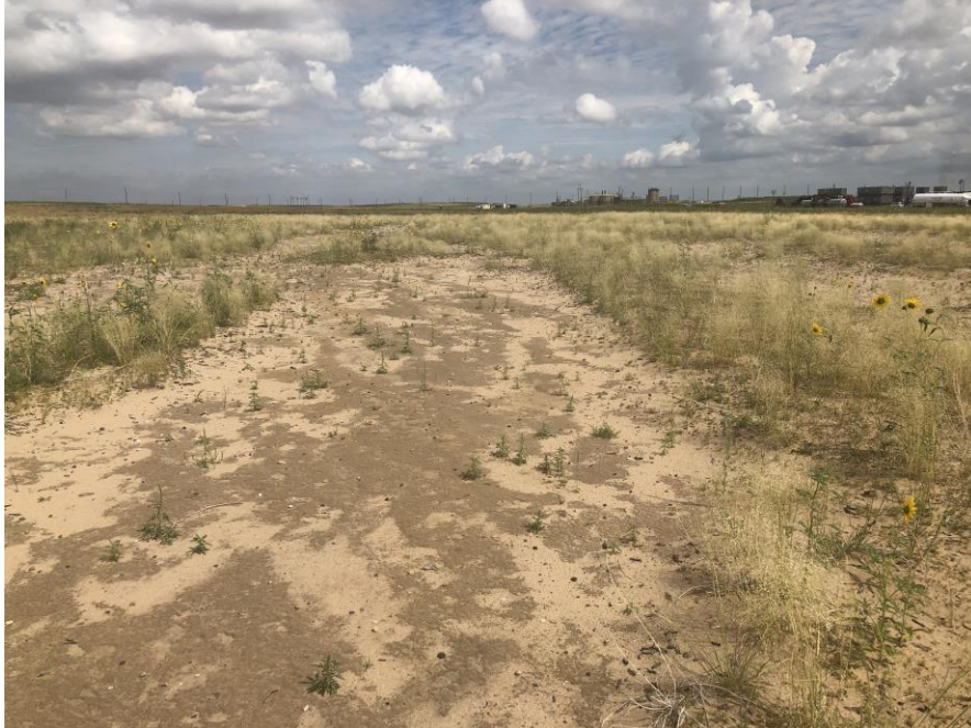
Reclaimed Topsand Stockpile at north end of site (was stockpile A-3)

Number of Partial Inspection this Fiscal Year: 1