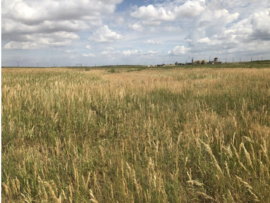
Area 24 (northwest corner of permit area)