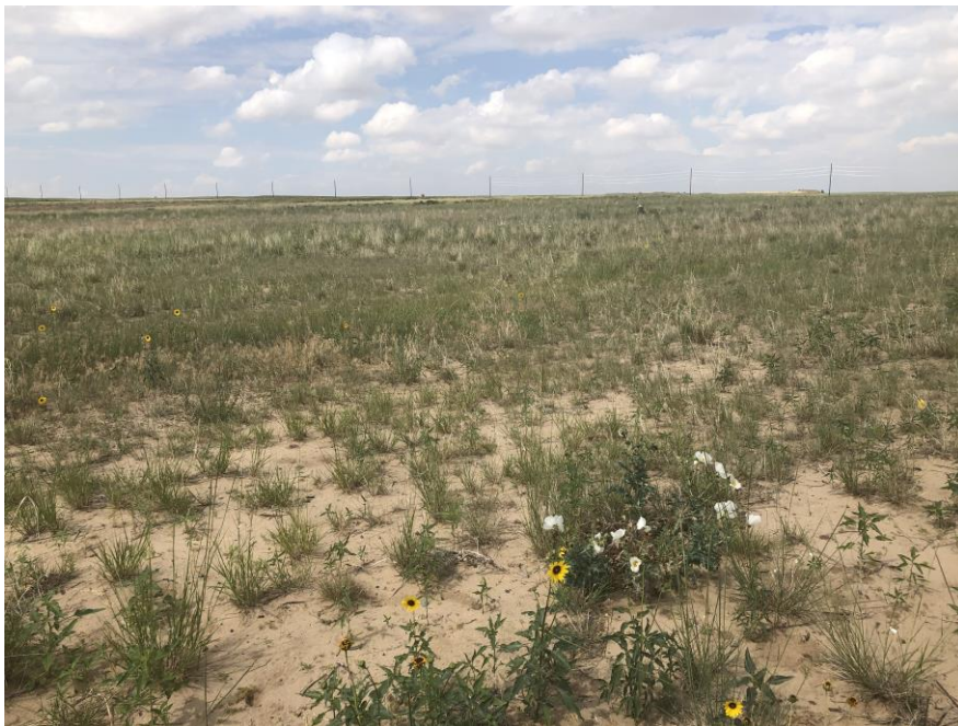
North end of B Pit

Number of Partial Inspection this Fiscal Year: 1