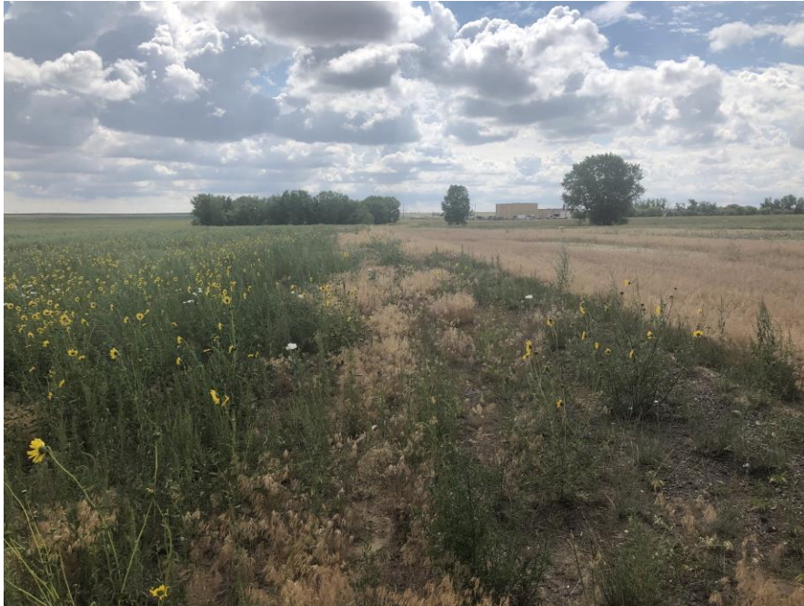
Area 42 with reclaimed road on right (tree clump is at Sediment Pond 2)