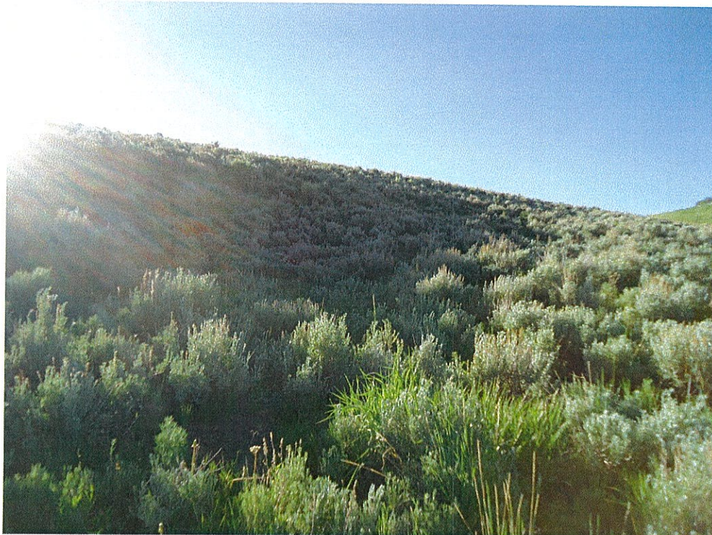
Photograph 2: North Site above the 7350 Bench Elevation (6/9/2021)