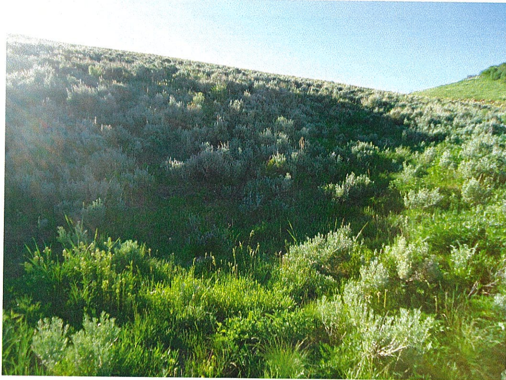
Photograph 1: South Site above the 7350 Bench Elevation (6/9/2021)