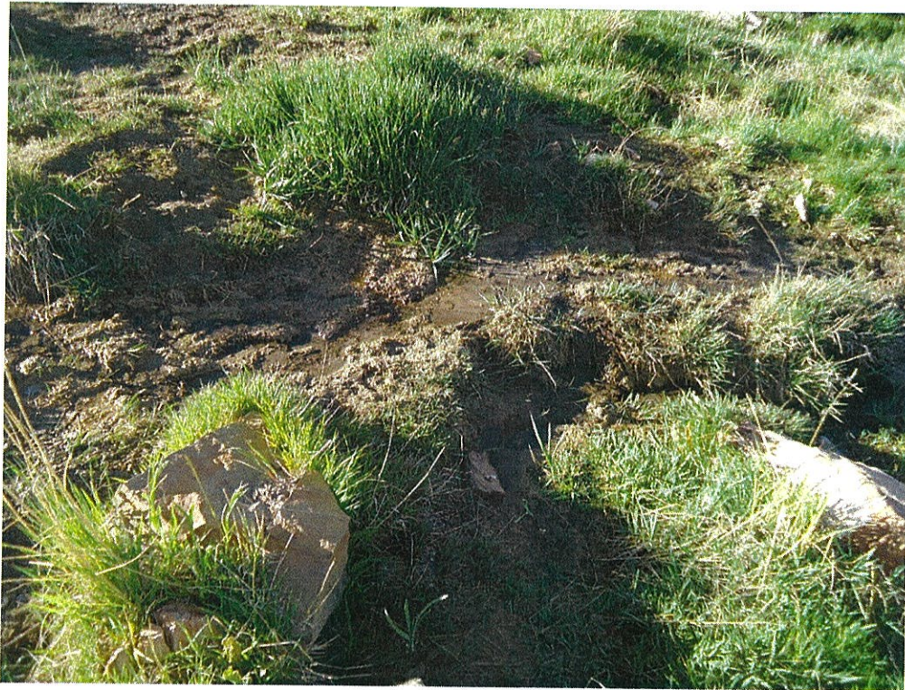
Photograph 3: Water from the Underdrainage System (6/9/2021)

Photograph 6 depicts the west facing slope of the fill in the area where the slope of the fill is at 3H: 1V.