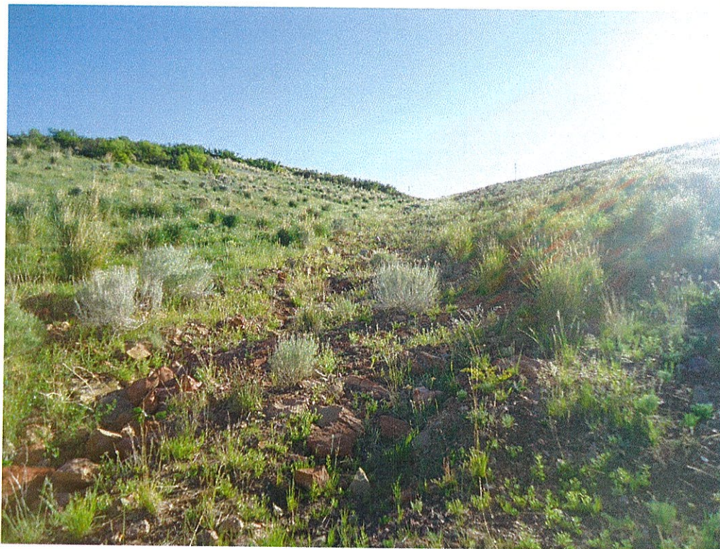
Photograph 4: North Surface Drain Looking North-east (6/9/2021)