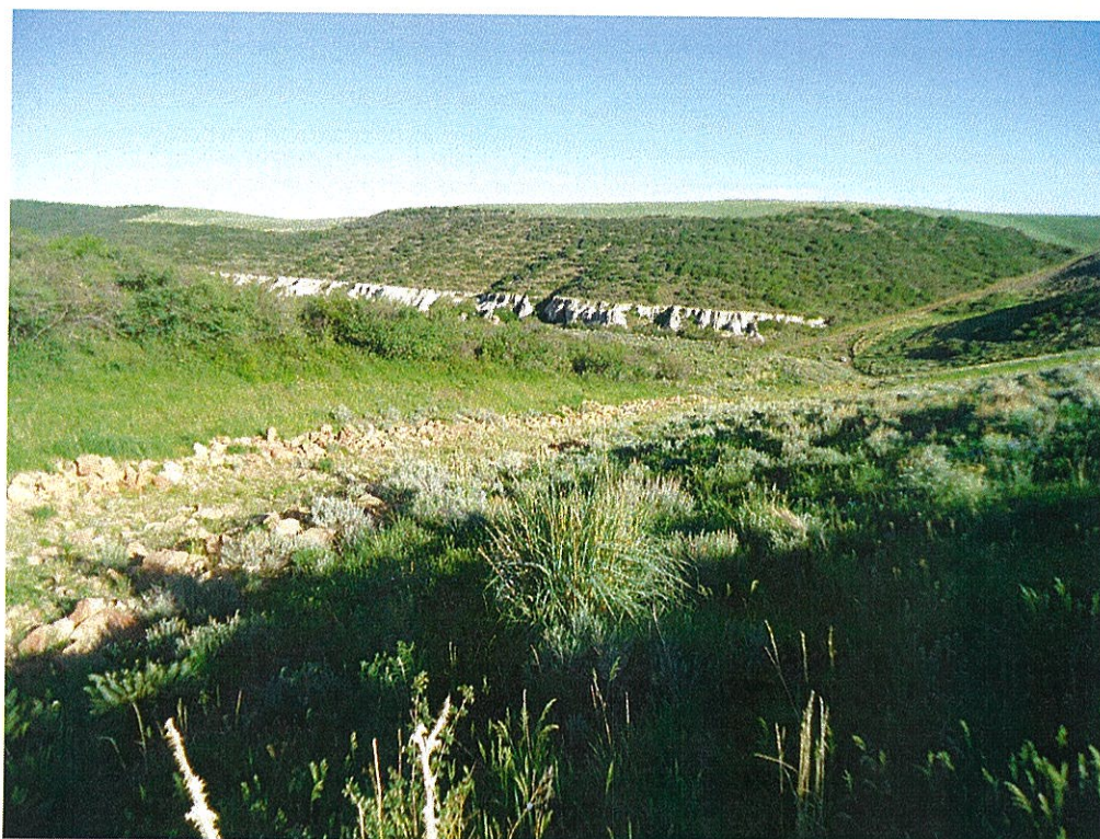
Photograph 5: South Surface Drain Looking West (6/9/2021)