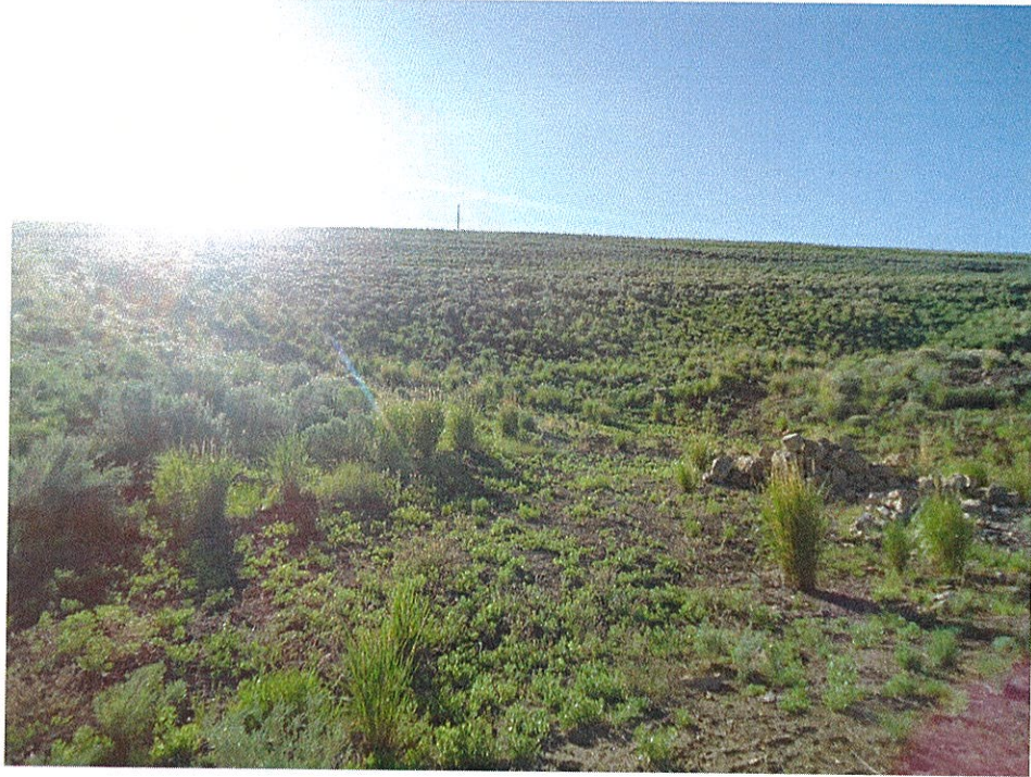
Photograph 6: West Side Fill 3H: 1V Face Looking East (6/9/2021)