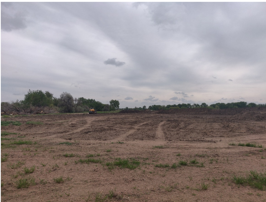
View of stripped equipment storage area in Phase 4 looking northeast from the southwest corner of the area