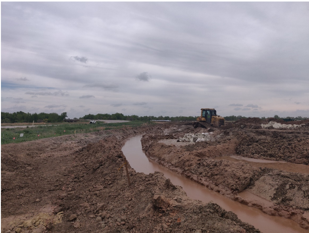
View of the slurry wall installation in the northwest corner of Phase 2