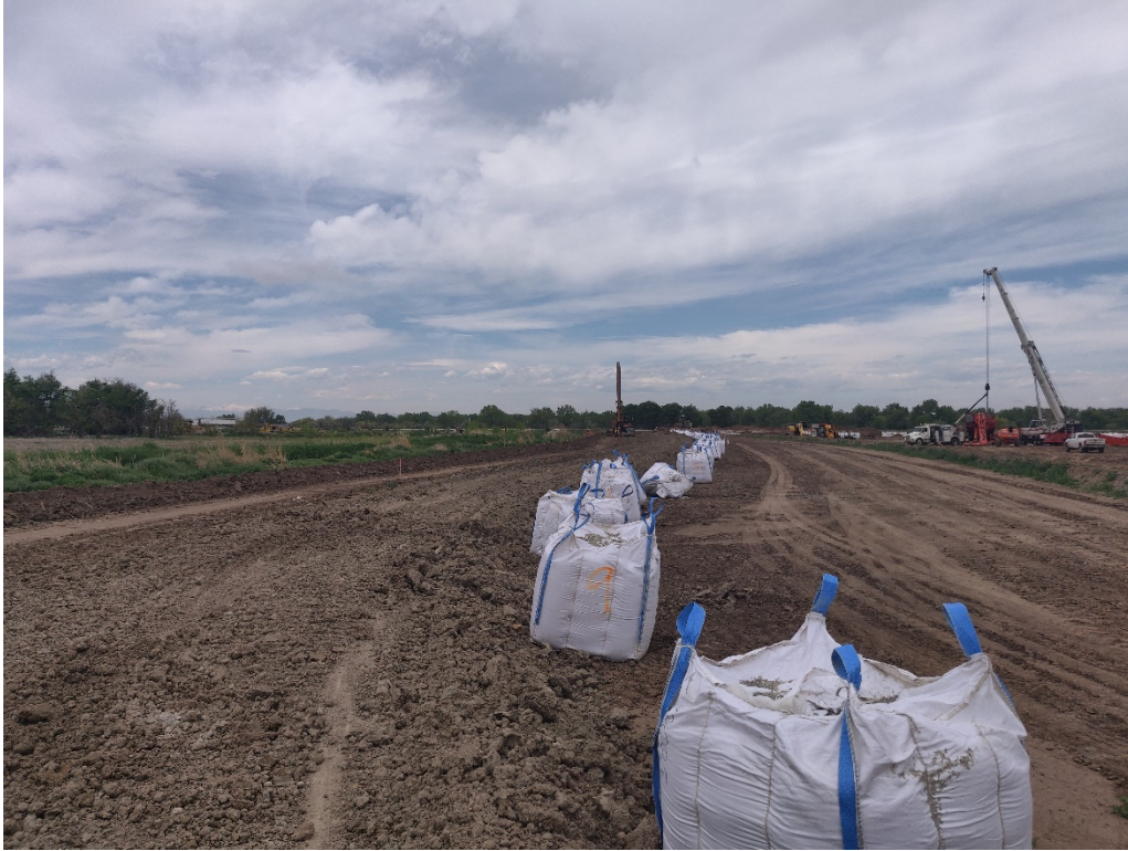
View of the stripped 120' slurry wall installation corridor