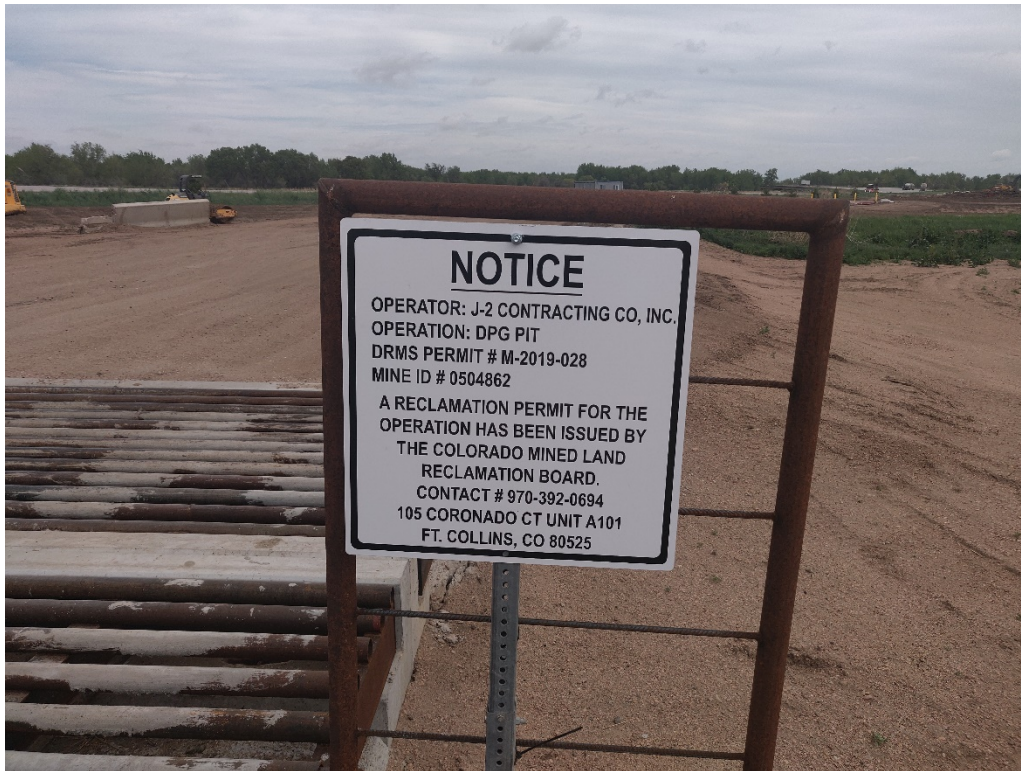
DPG Pit mine sign