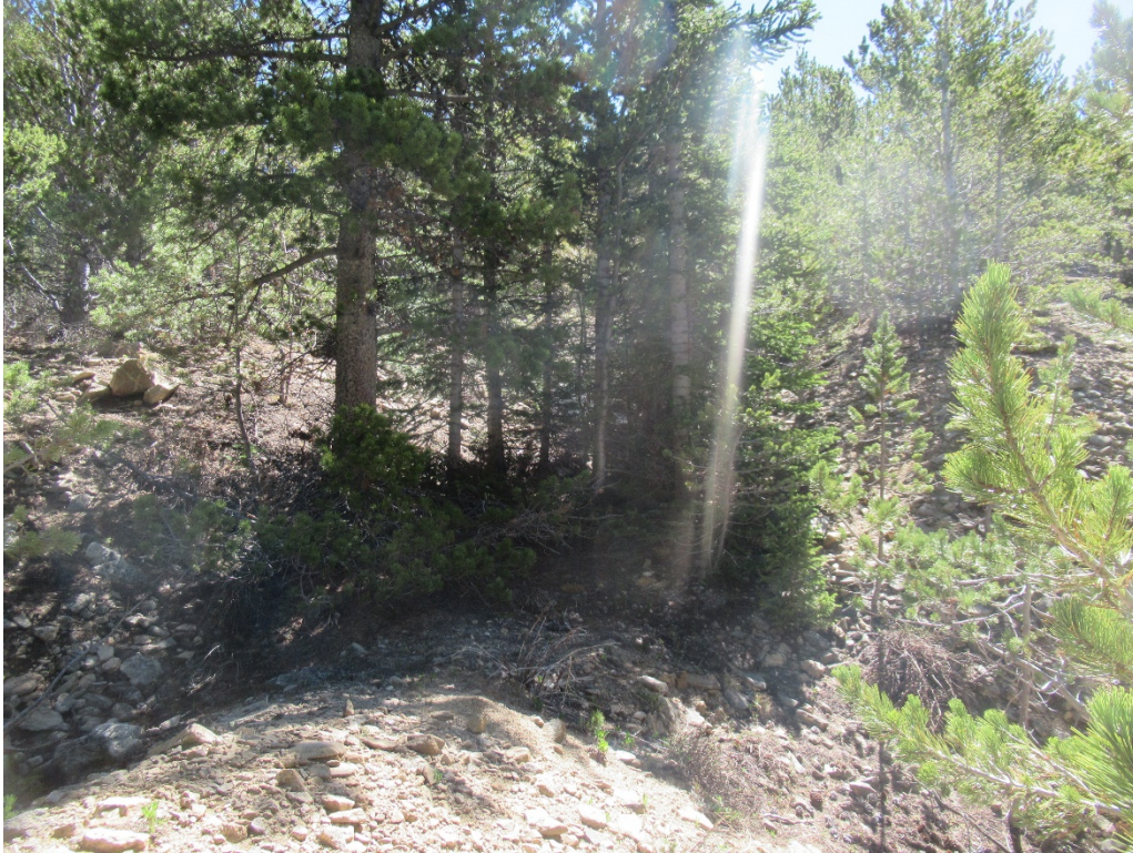
View of the collapsed Lombard #3 adit