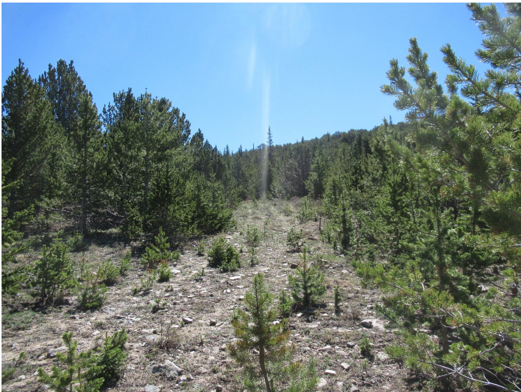
View of the access road from Cumberland Gulch Road to the Lombard #3 adit