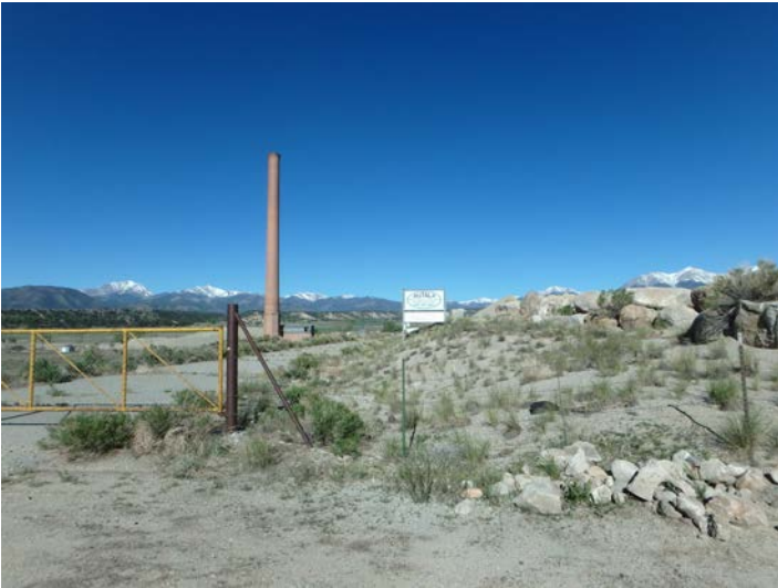
ID sign at site entrance