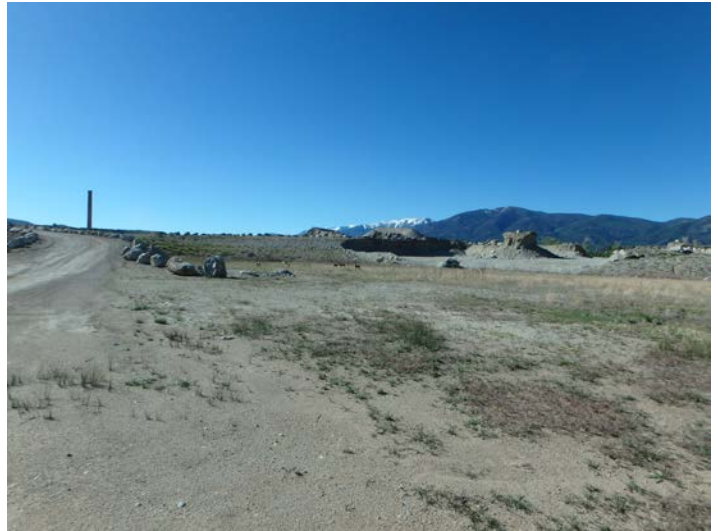
Phase 1 area