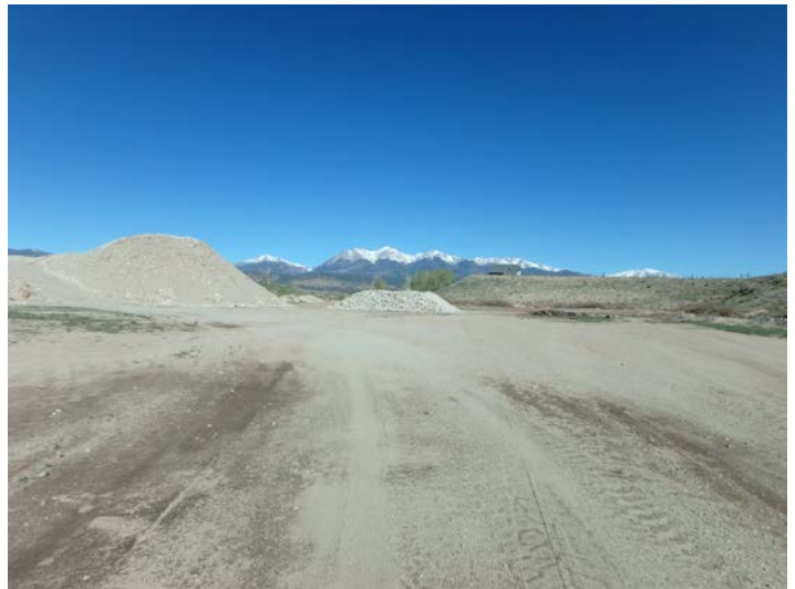
Phase 1 area