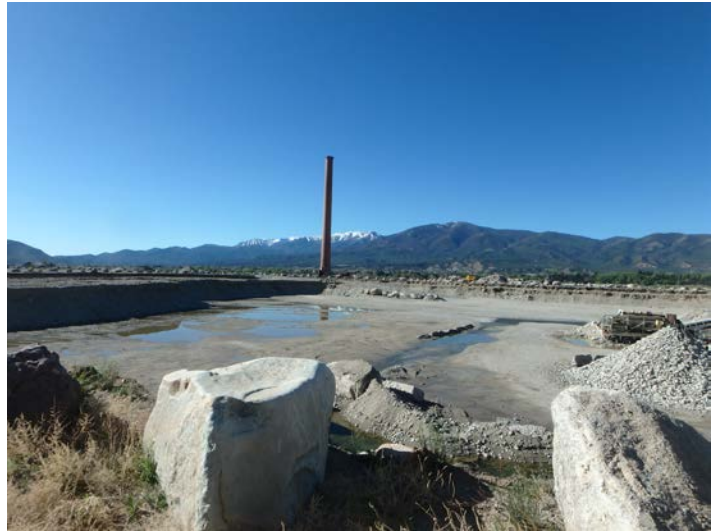
Phase 4 area