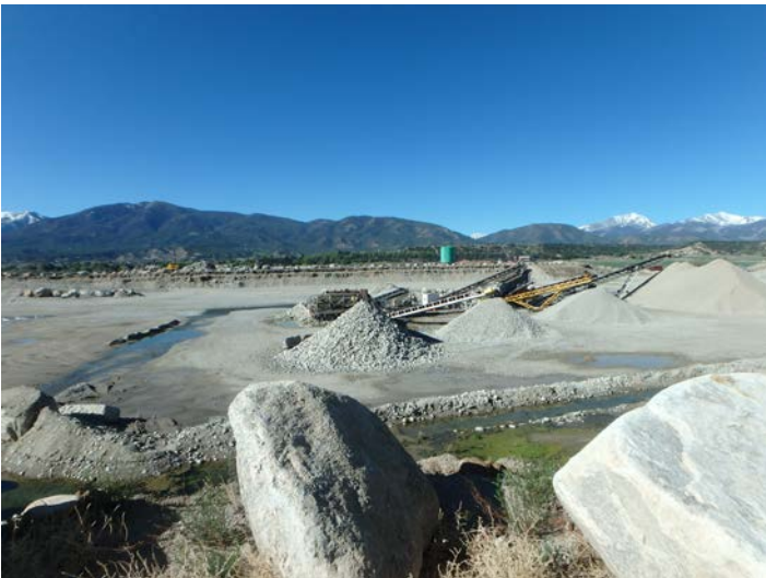
Phase 3/4 area