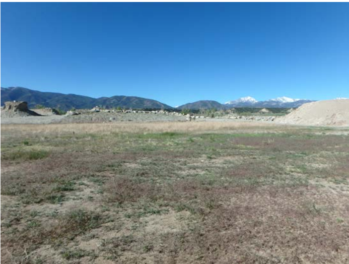
Phase 1 area