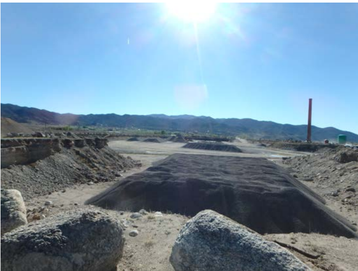
Phase 3 area