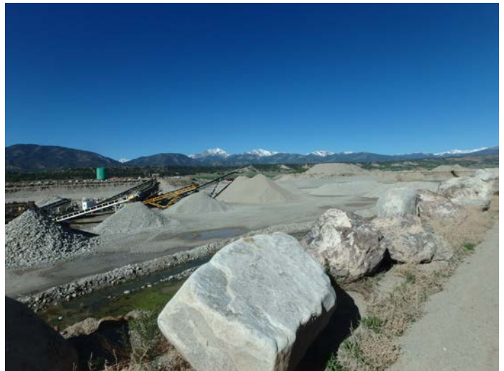
Phase 3/4 area

Thomas Eve Butala Construction Company 9000 CR 152 Salida, CO 81201