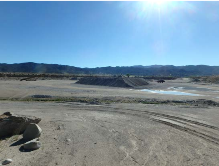
Phase 3 area