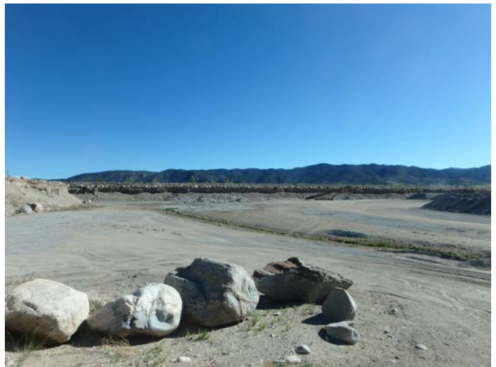
Phase 3 area