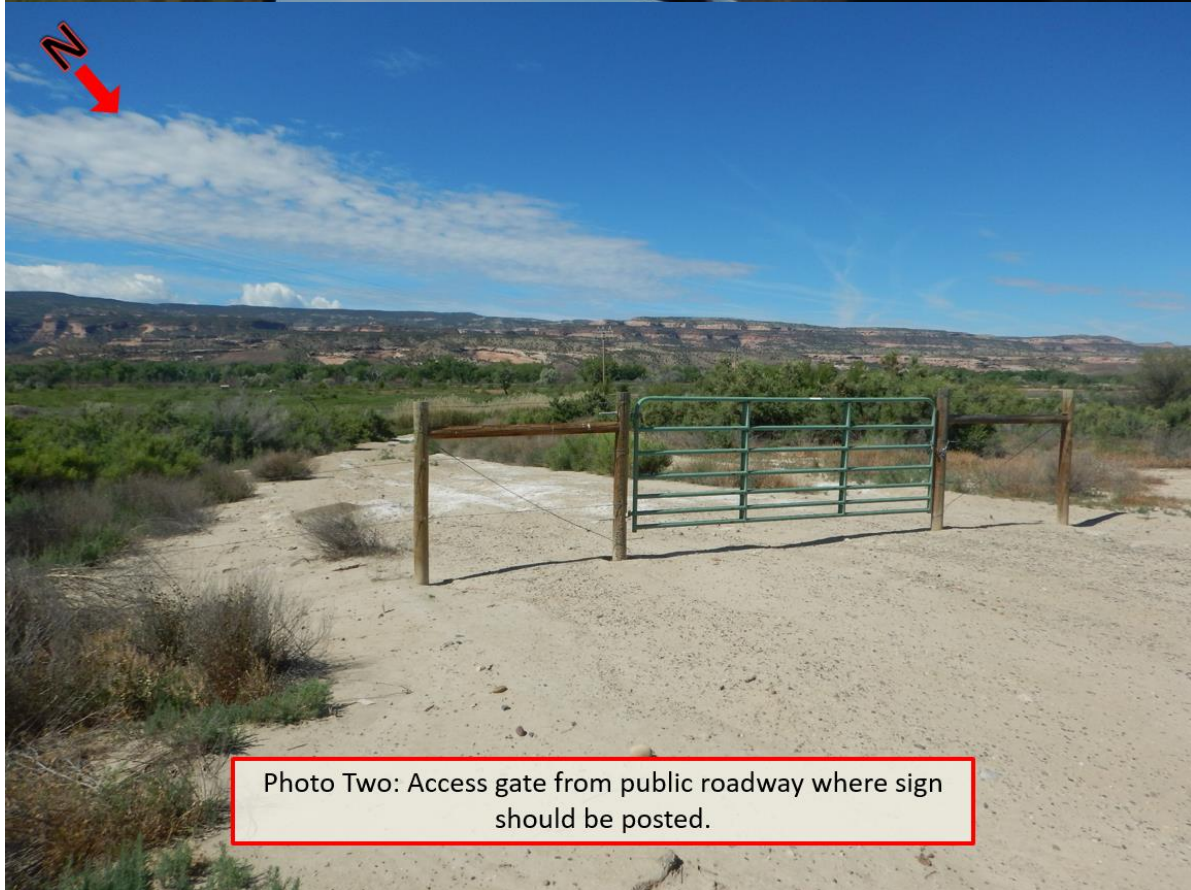
Photo Two: Access gate from public roadway where sign should be posted.