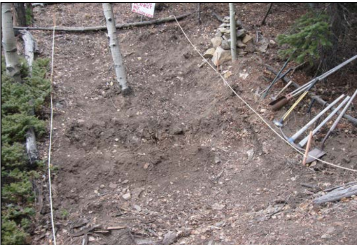
3. Excavation area.