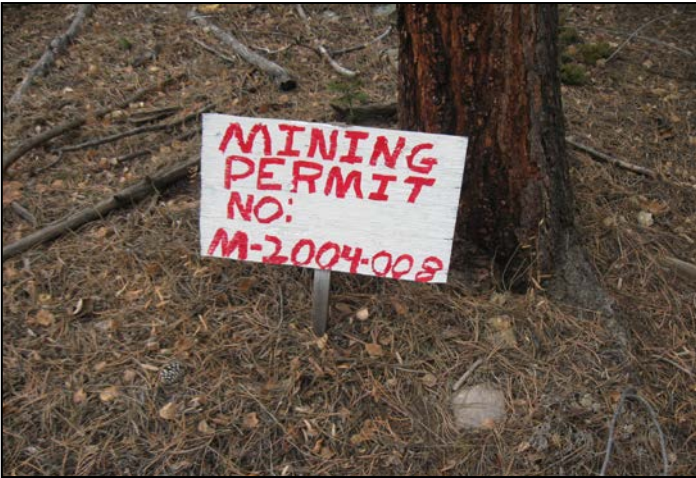
1. Permit sign.