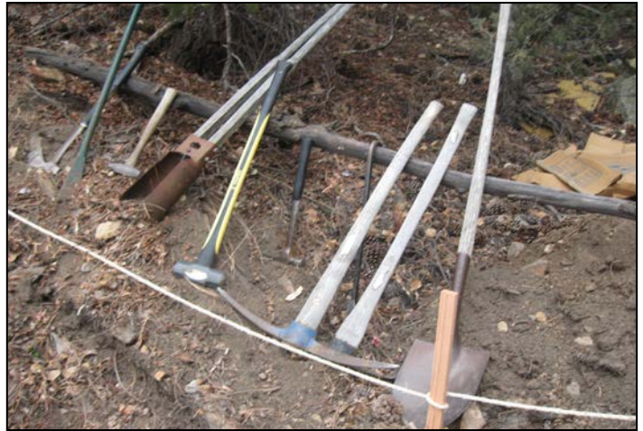
2. Hand tools.