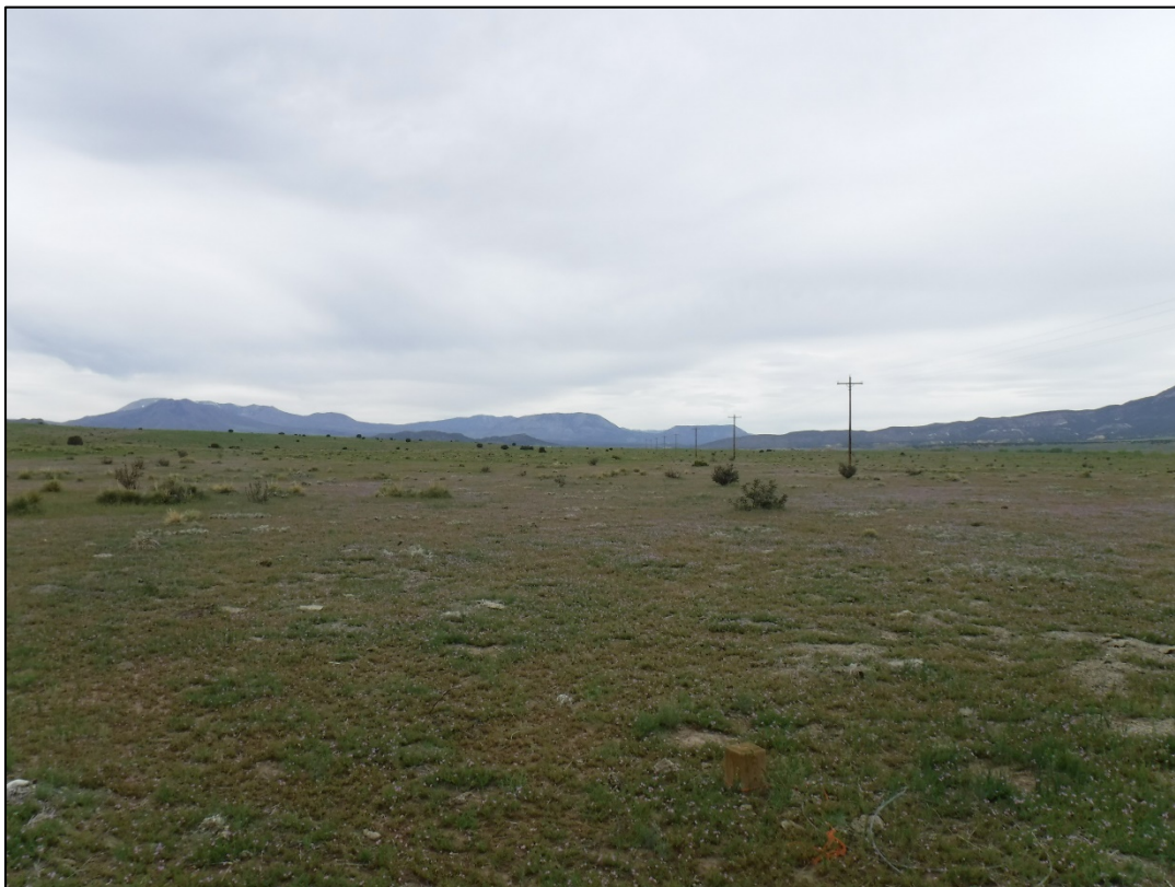
Photo 2: Looking west across permit area along the power line corridor