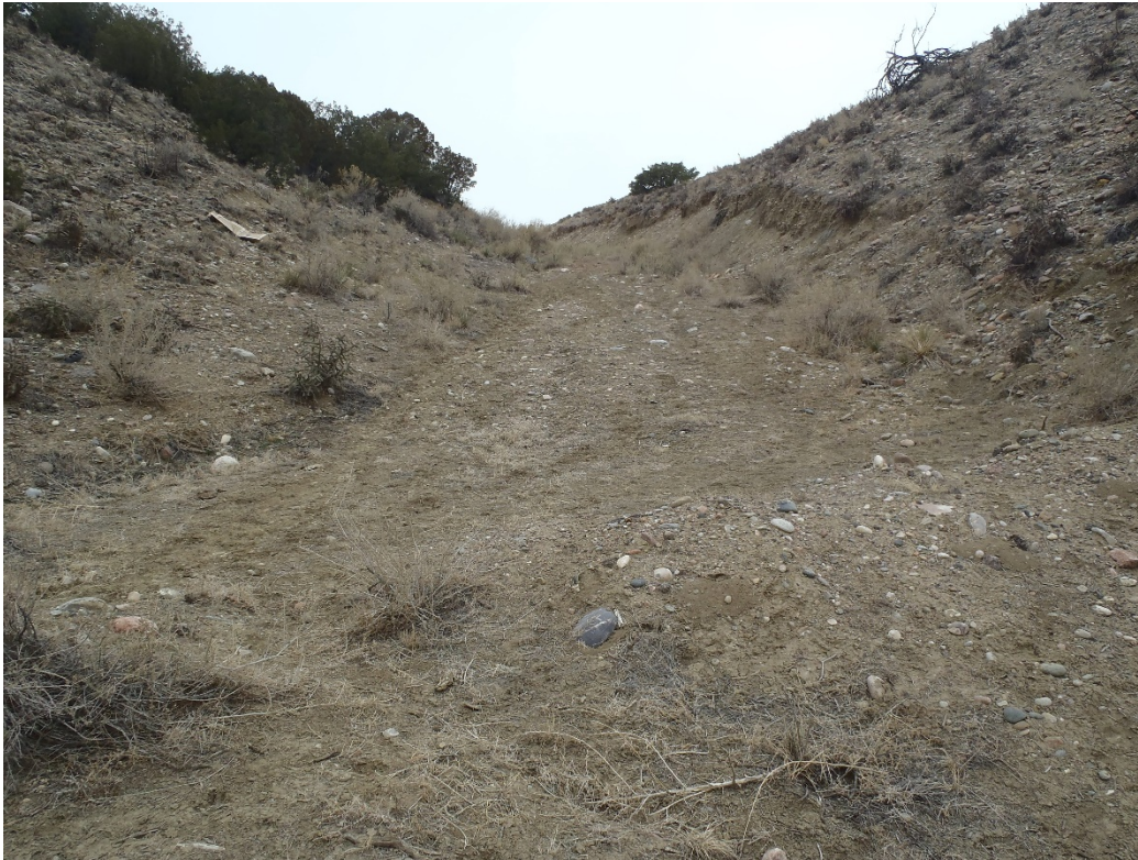
Photo 2. East end of access road cut (looking west from east end).