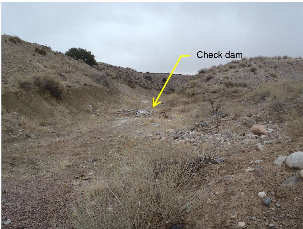
Photo 1. West end of access road cut and typical rock check dam (looking east from west end).