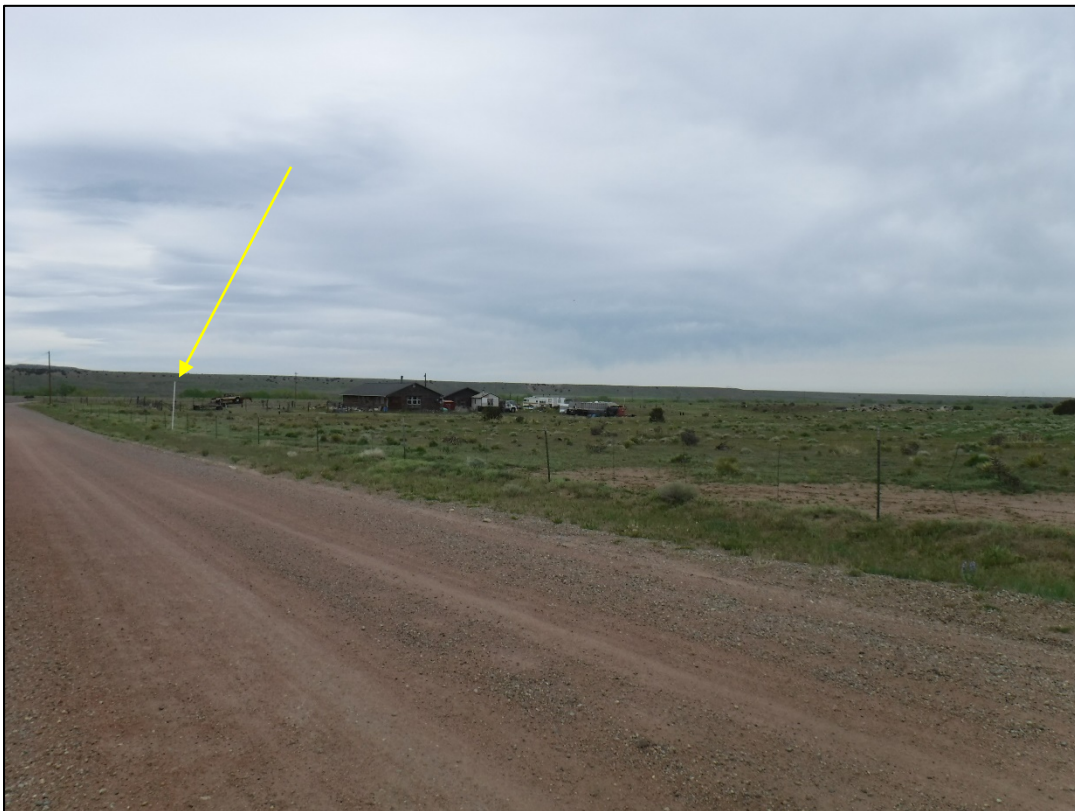
Photo 4: Private residence located north of permit boundary, boundary marker yellow arrow