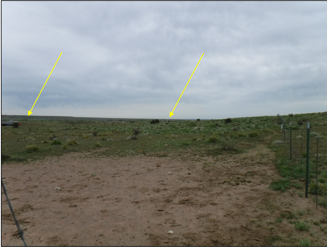
Photo 3: Looking northeast across the proposed mine area, permit boundary markers indicated by yellow arrows