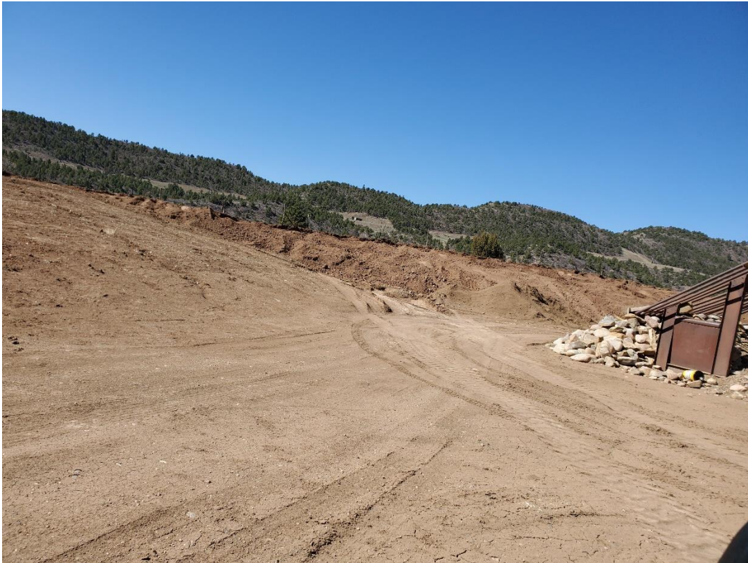
Highwall Torn down