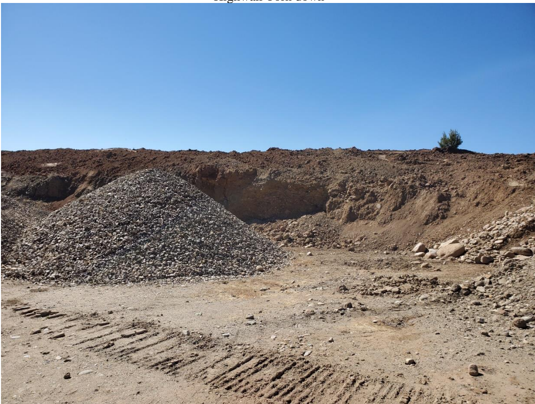
Last of the Highwall