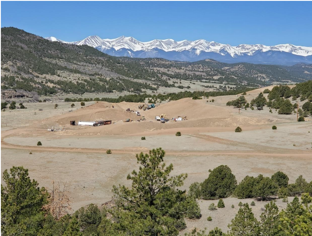
Area 2 overlooking Area 1