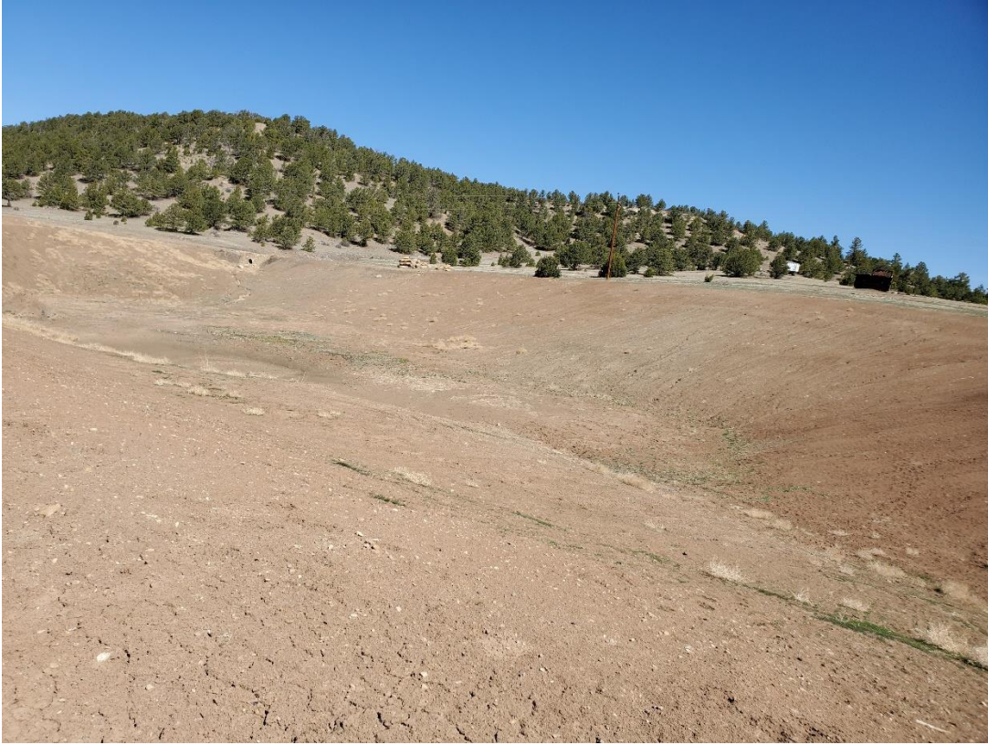
Area where water has been seen in the past