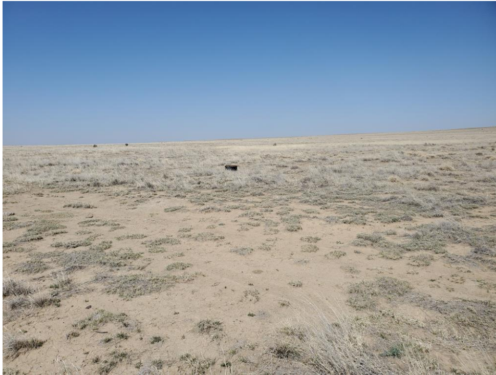
Facing West from North East Corner