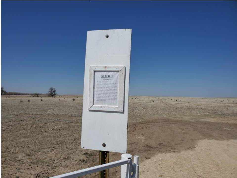
Notice Posted at Entrance