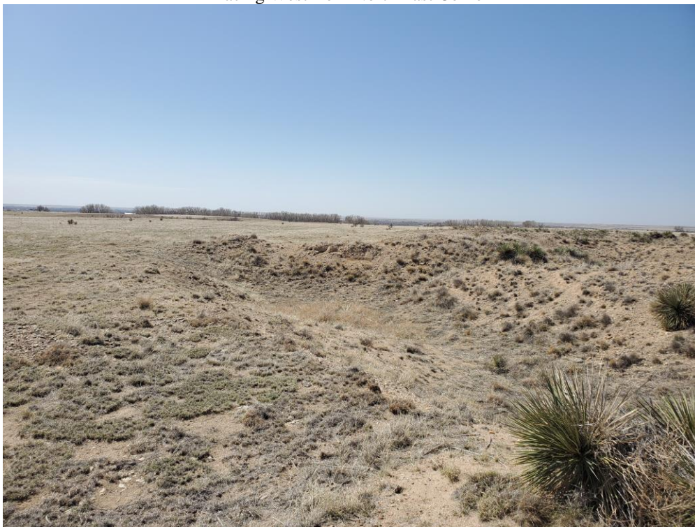
Facing East from North West Corner