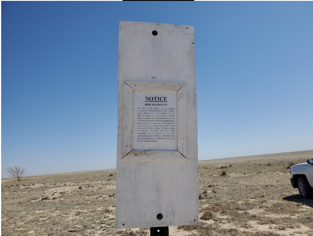
Notice posted at Entrance