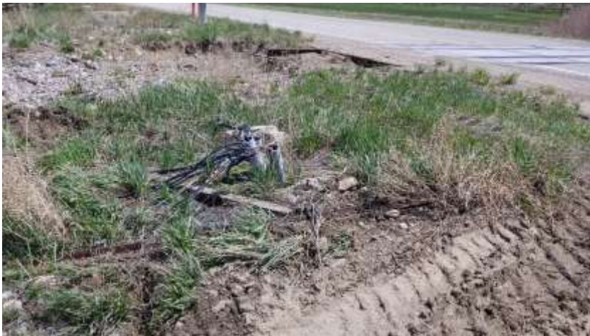
Photo below is looking southwest across remaining area to be reclaimed on the north side of Hwy 40

Photo below shows remaining track and wiring to be removed.