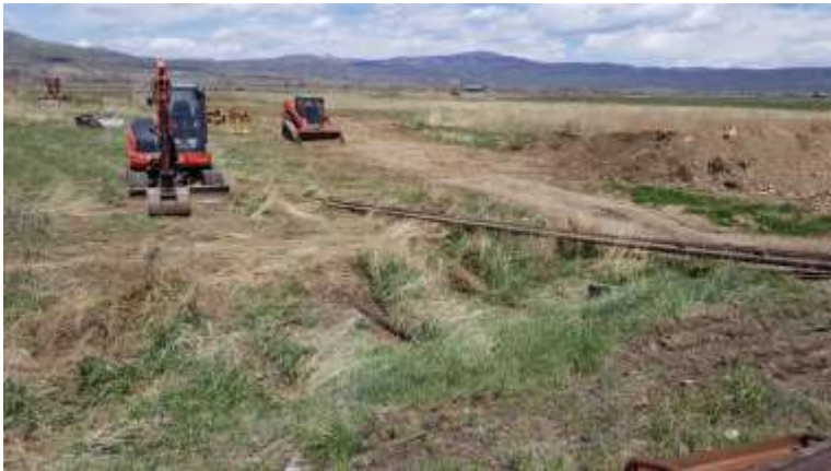
Photo below shows remaining track and wiring to be removed.